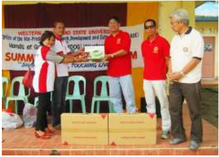
Turnover of the nebulizer to the Western Mindanao State University Extension Office. This was done last May 28, 2011 at the Kalinaw Village, Sinunuc, Zamboanga City. Aside from the nebulizers, the club also gave two sets of burners for their use in their outreach program. To note, the WMSU Extension Office is a outreach program partner of RC-Metro Zamboanga.