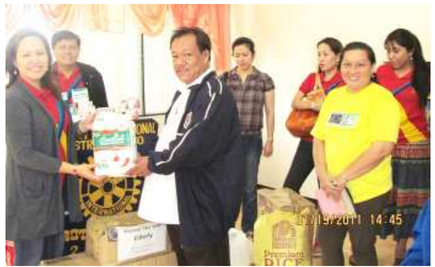
Rotary Club of Zamboanga City West Annual Assistance to the Home for the Elderly last January 19, 2011.