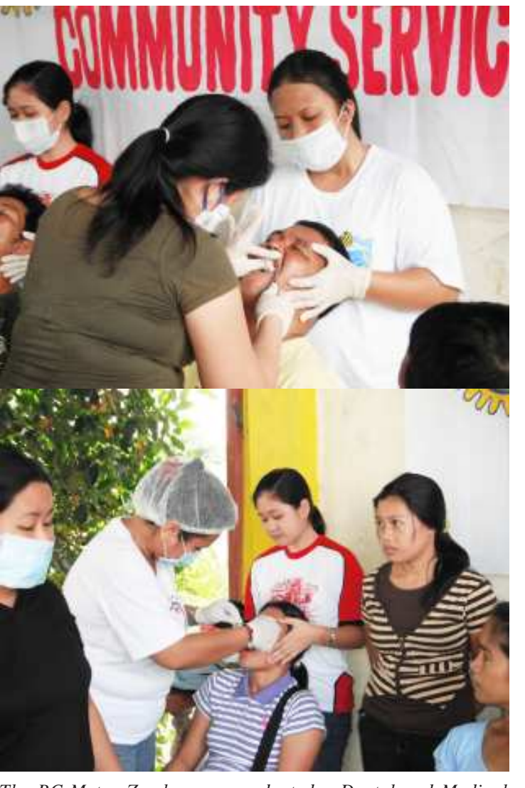
The RC-Metro Zamboanga conducted a Dental and Medical Mission at Barangay Salaan, Zamboanga City. There were 300 barangay residents who benefited from the project.