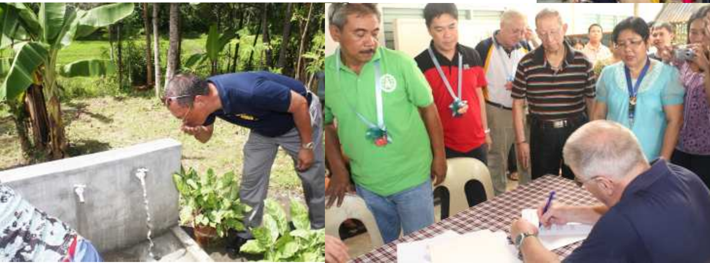
Rotary Club of Iloilo City Solar Powered Water Pumping and Purification System which benefitted the people of Santa Barbara.