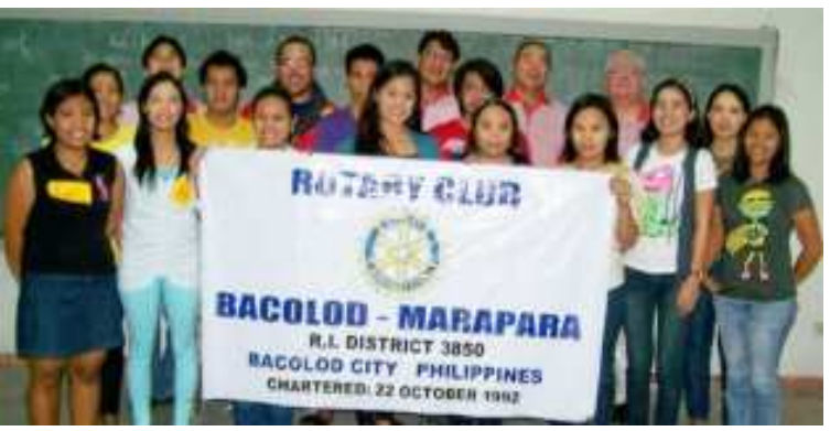
Would-be call center agents with members of the Rotary Club of Bacolod Marapara.