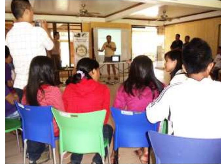
Rotary Club of Bacolod North Community Project Kabug Rotary Club of Bacolod North Rotary Youth Leadership Awards (RYLA) last January 29, 2011