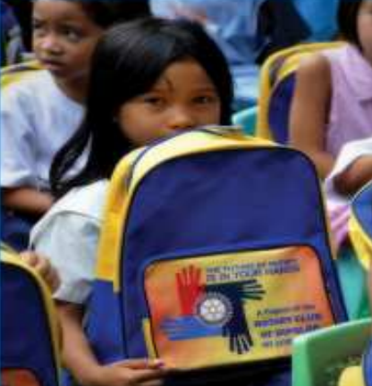
Governor's Monthly Letter December 2010