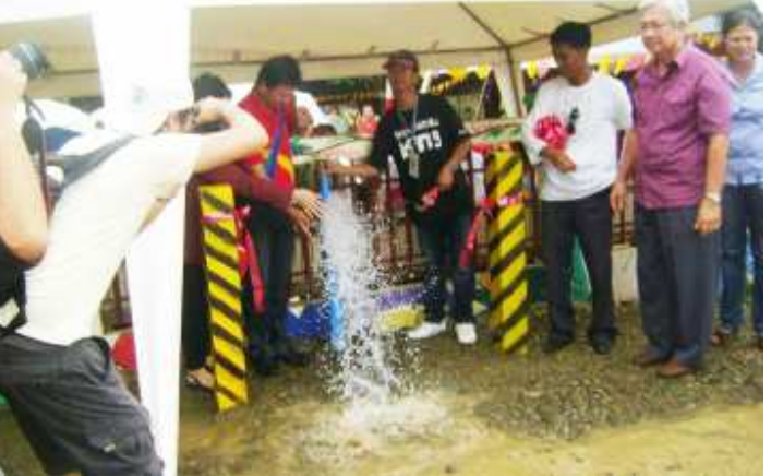
Rotary Club of Zamboanga City West Water Project Inauguration last October 8, 2010