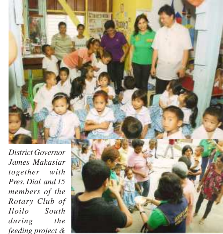
gift giving for the children of an adopted day care center in brgy. Cubay, Jaro last August 13, 2010. A total of 100 children were fed.