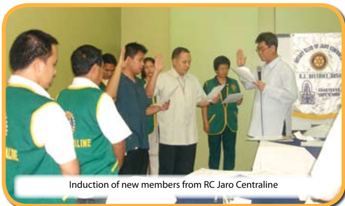
Induction of new members from RC Jaro Centraline