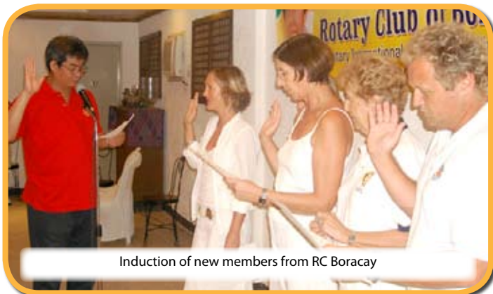
Induction of new members from RC Boracay