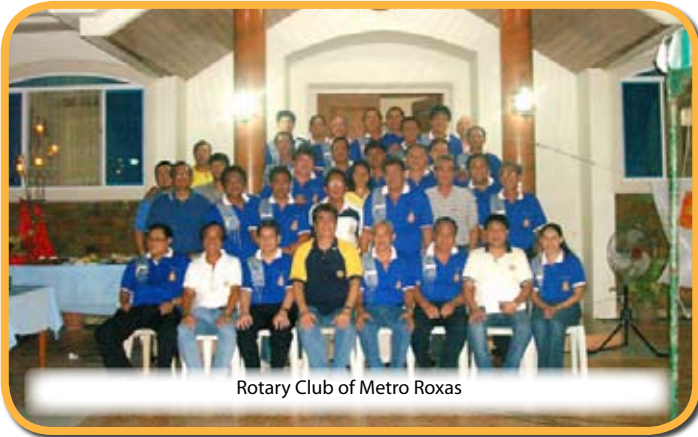
Rotary Club of Metro Roxas