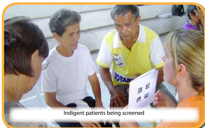
Indigent patients being screened