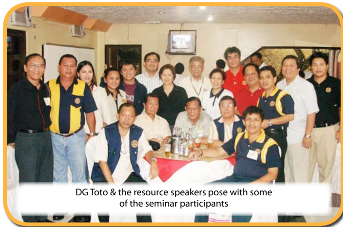
DG Toto & the resource speakers pose with some of the seminar participants