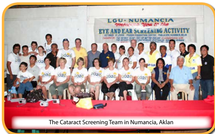
The Cataract Screening Team in Numancia, Aklan

On the 10th year of Eye Screening and the inclusion of Ear Screening this year, a joint collaboration among the Rotary Clubs in District 3850 was formed. Rotary Clubs of Metro Iloilo, Metro Kalibo and Boracay arranged and assisted RC Bacolod North, RC Canterbury and CFPI with the all the logistic support, coordination with local government, gathering of cataract patients and lastly identifying the towns and venue for this project.