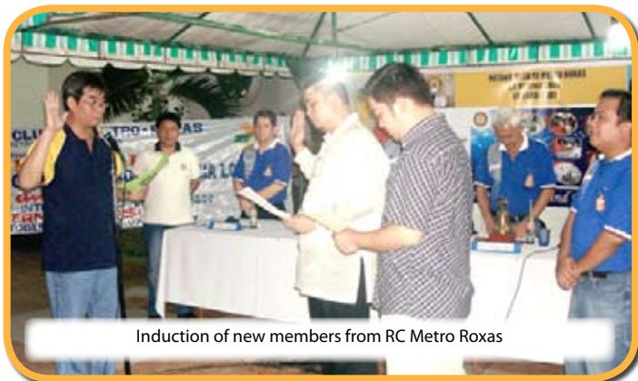
Induction of new members from RC Metro Roxas