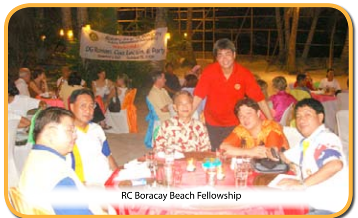
RC Boracay Beach Fellowship