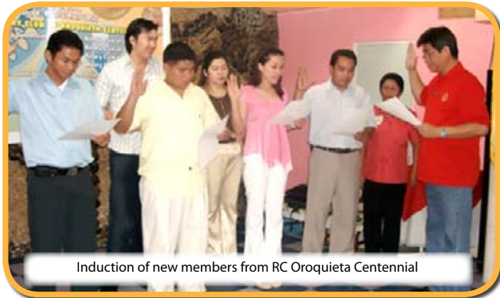
Induction of new members from RC Oroquieta Centennial