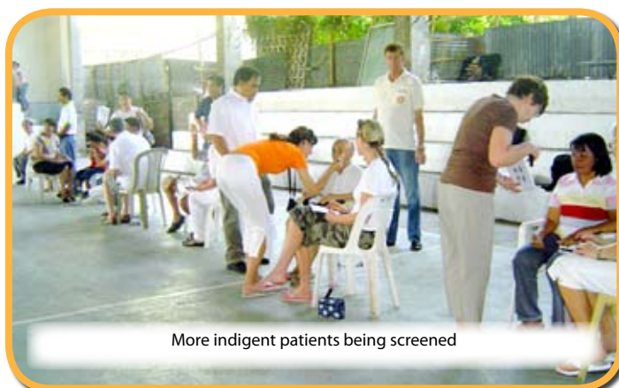
More indigent patients being screened