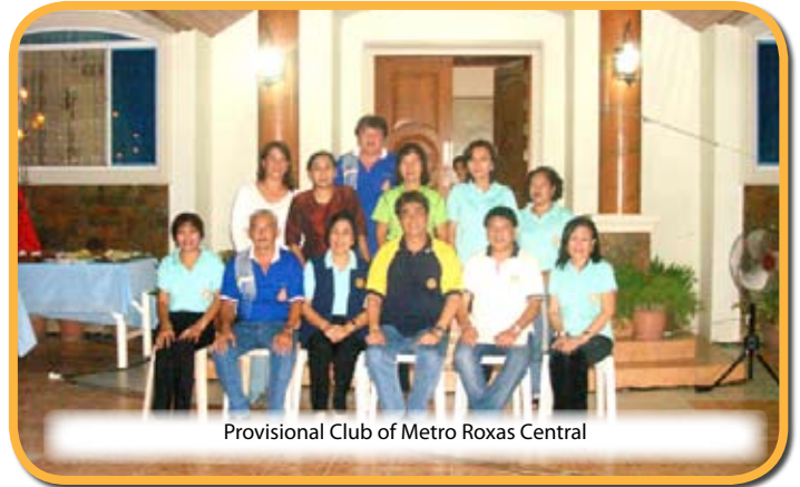
Provisional Club of Metro Roxas Central