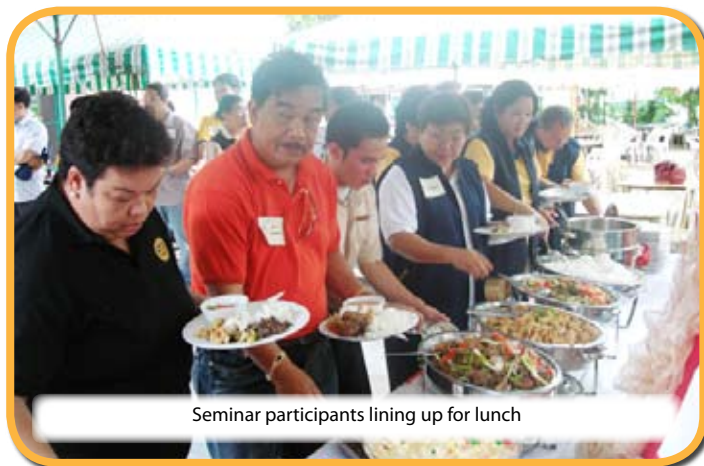
Seminar participants lining up for lunch