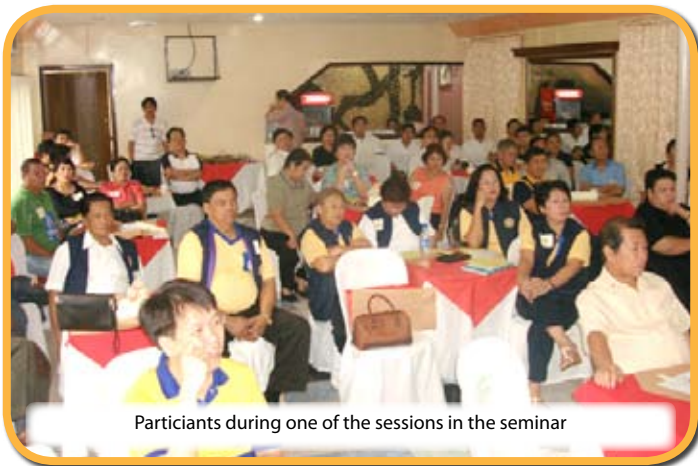
Participants during one of the sessions in the seminar