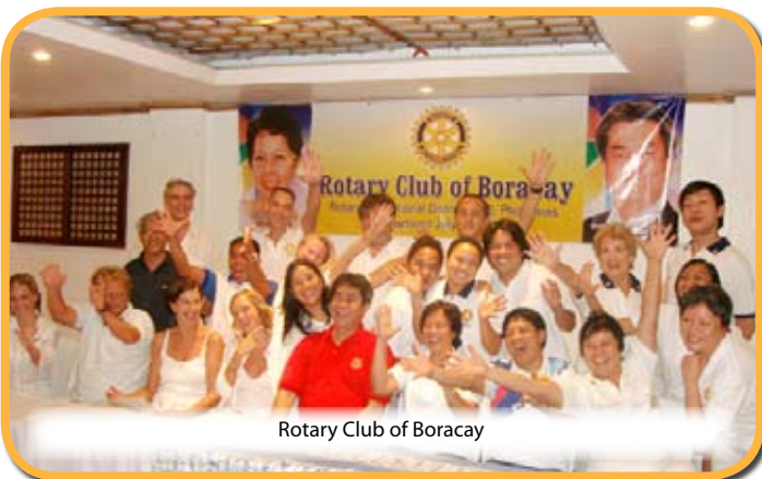
Rotary Club of Boracay