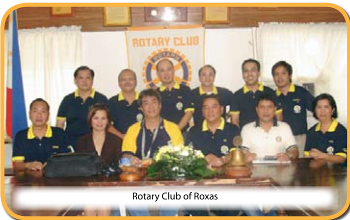
Rotary Club of Roxas