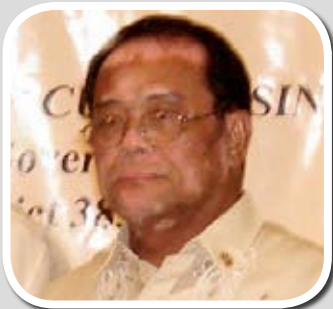
PP Maximo Cascara PHF+7 RC Pagadian