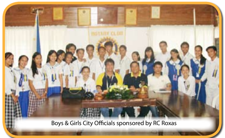
Boys & Girls City Officials sponsored by RC Roxas