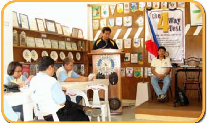
DG Toto delivering his message during the Governor's visit with RC of Kalibo