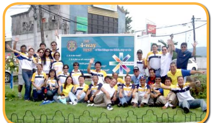
RC Zamboanga West's public image project on the 4-Way Test