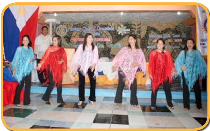
Lady Rotarians and Spouses of RC Oroquieta Centennial performing a dance number at the Governor's Address and Ball