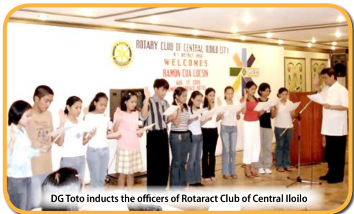
DG Toto inducts the officers of Rotaract Club of Central Iloilo