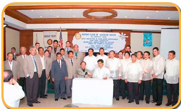
Matched Club Agreement between RC Bacolod South and RC Balintawak, QC