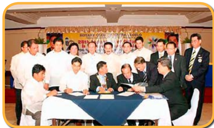
Matched Club Agreement between RC Metro Iloilo and RC Manila Metro, RC Balintawak and RC San Pedro