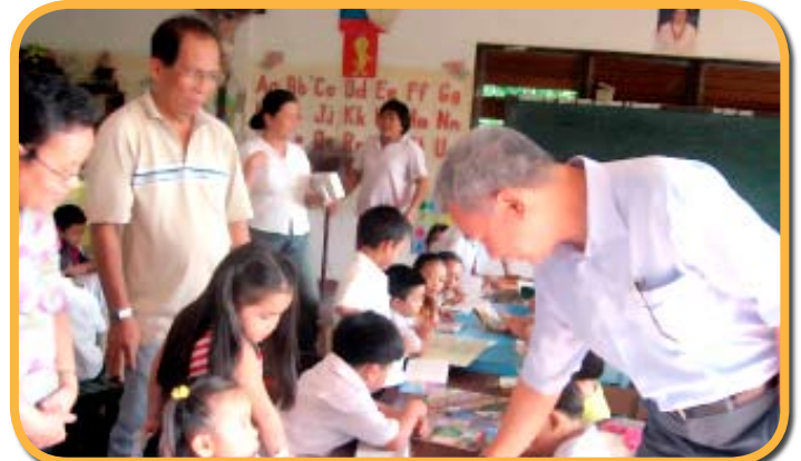
RC Iloilo Books distribution project at Bakhaw Daycare Center