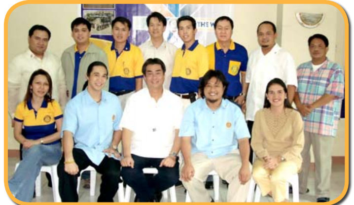
Governor's Visit with RC Dipolog led by Pres. Oliver Almonte.