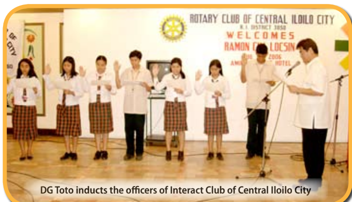
DG Toto inducts the officers of Interact Club of Central Iloilo City