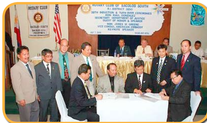
Matched Club Agreement between RC Bacolod South and RC Manila Metro