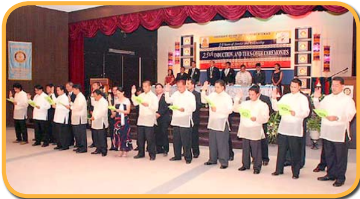
Induction of twelve (12) new members of RC Metro Roxas