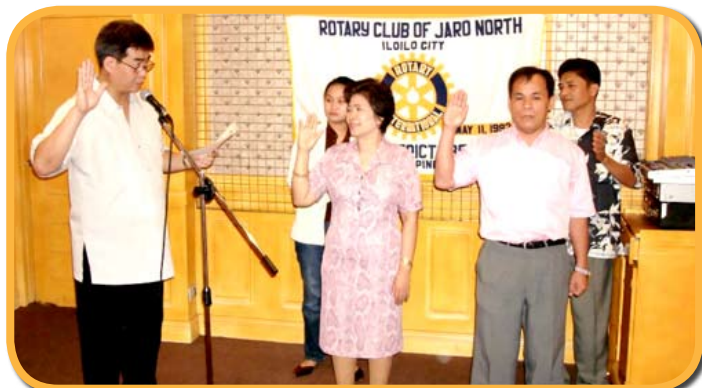
Induction of two (2) new members of RC Jaro North.