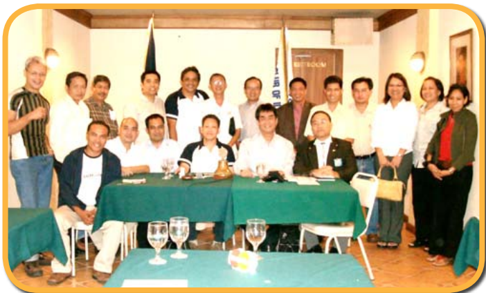
Governor's Visit with RC Iloilo West led by Pres. Ahmed Pama