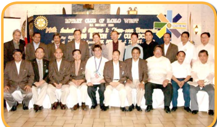
Pres. Ahmed Pama, officers and members of RC Iloilo West pose with DG Locsin during their induction ceremony held at Hotel del Rio.