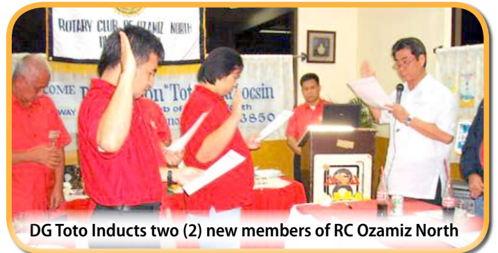
DG Toto Inducts two (2) new members of RC Ozamiz North