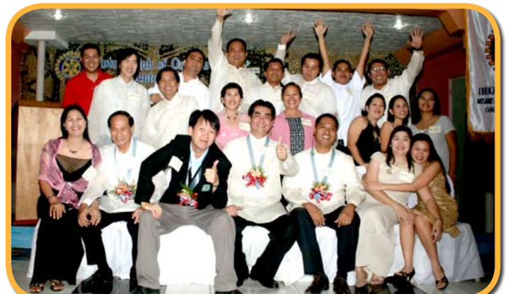
Governor's Visit with RC Oroquieta led by Pres. Kane Iyog