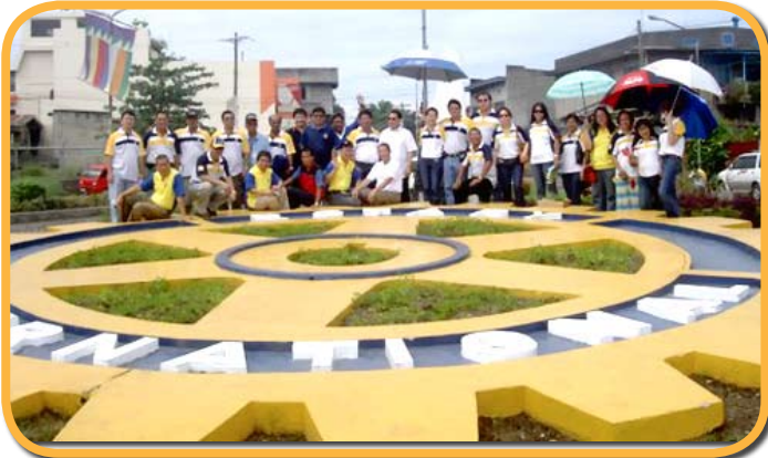
RC Zamboanga City West's Public Image Project.