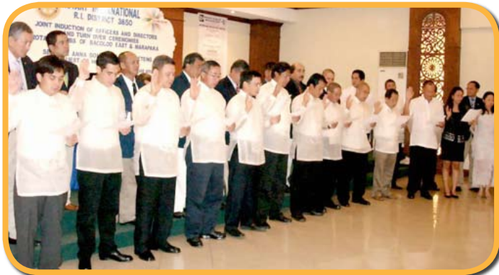
Joint Induction of new members of RC Bacolod Marapara and RC Bacolod East