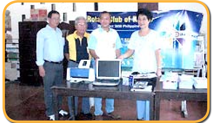
RC Kalibo Donated a computer with printer to New Buswang Elementary School in Kalibo, Aklan.