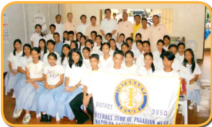
DG Toto and officers of RC Pagadian West pose with members of Interact Club of Pagadian West