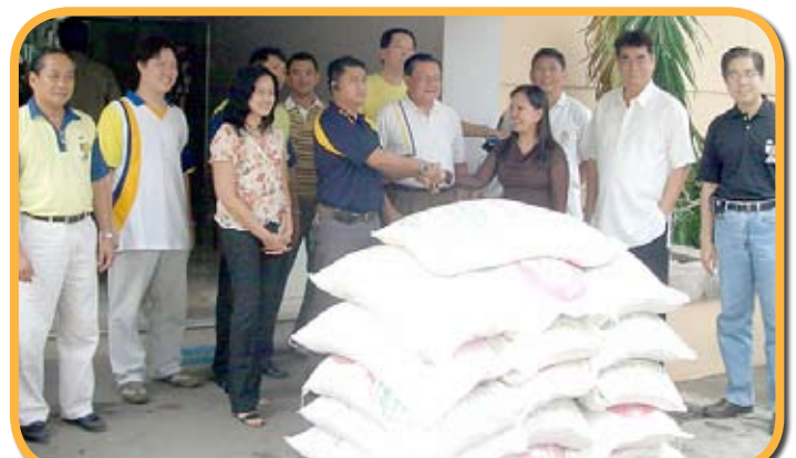
RC Metro Iloilo donates 16 sacks of rice to the Solar Oil Spill victims in Guimaras. The donations was coursed through ABS-CBN.