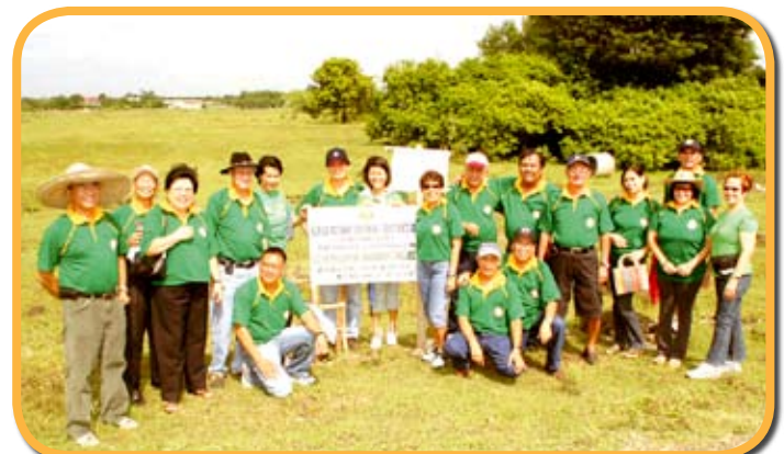
Iloilo South participates in the Green Philippine Highways Project