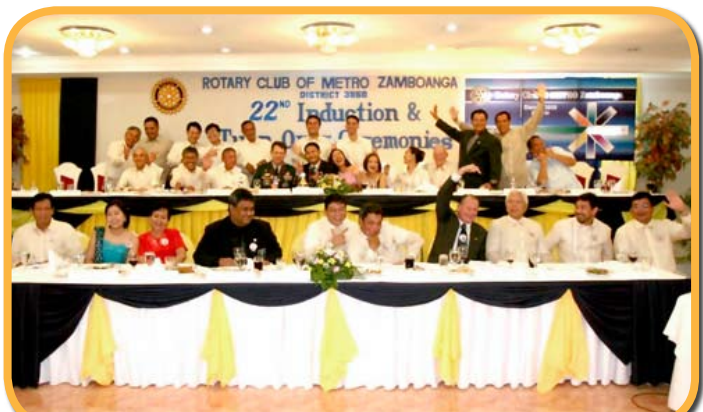
Induction of Officers and Directors of RC Metro Zamboanga