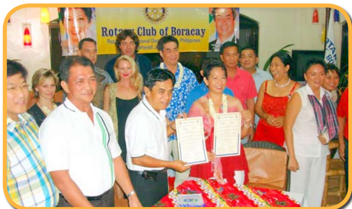
Matched Club Agreement between RC Boracay and RC San Pedro