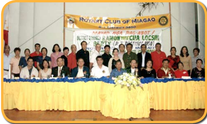
Governor's Visit with RC Miag-ao led by Pres. Rolando "Gingging" Navarro