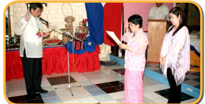
Induction of one (1) new member of RC Oroquieta Centennial