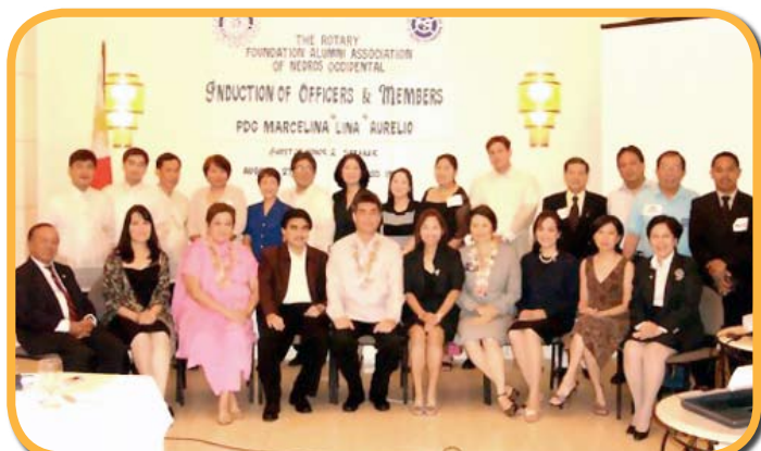
First Induction of The Rotary Foundation Alumni Association of Negros Occidental.