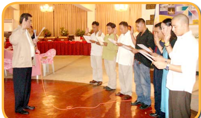
Pres. Bullet Jalosjos and officers of RC Dapitan inducted into office by DG Toto Locsin.