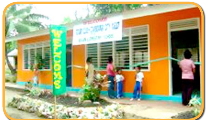
RC Zamboanga City West renovated three (3) dilapidated classrooms and turned them into modern functional Day Care Center classrooms.