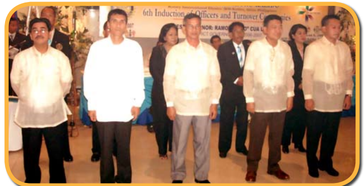
Induction of five (5) new members of RC Metro Kalibo