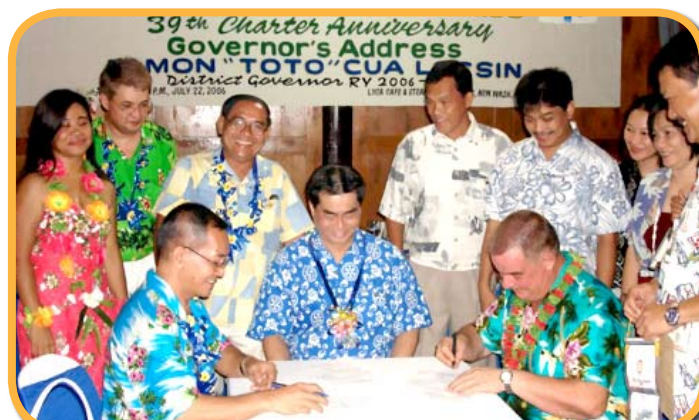
Matched Club Agreement between RC Kalibo and RC General Mariano Alvarez Cavite