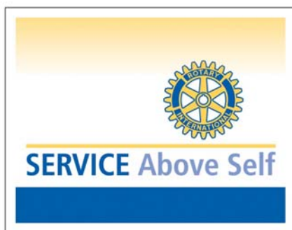
ROTARY INTERNATIONAL THEME 2005 - 2006

With this in mind, I looked to the many wise words that Rotarians have written over the past century to select a theme that best expresses our vital mission. Of all the inspirational messages that have guided our thinking and motivated us to action, I found none that defined Rotary and the Rotarian spirit better than the three simple words of our motto, Service Above Self .