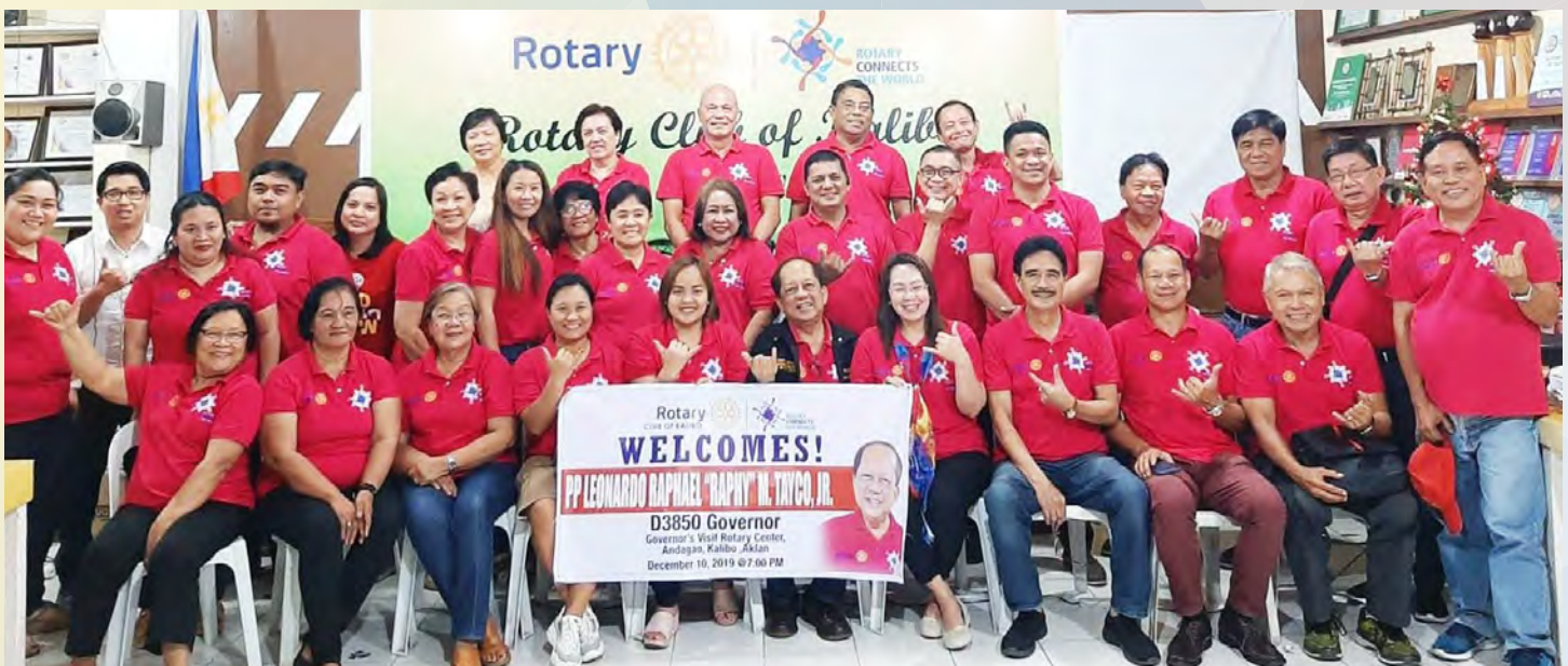
December 10, 2019 - Rotary Club of Kalibo