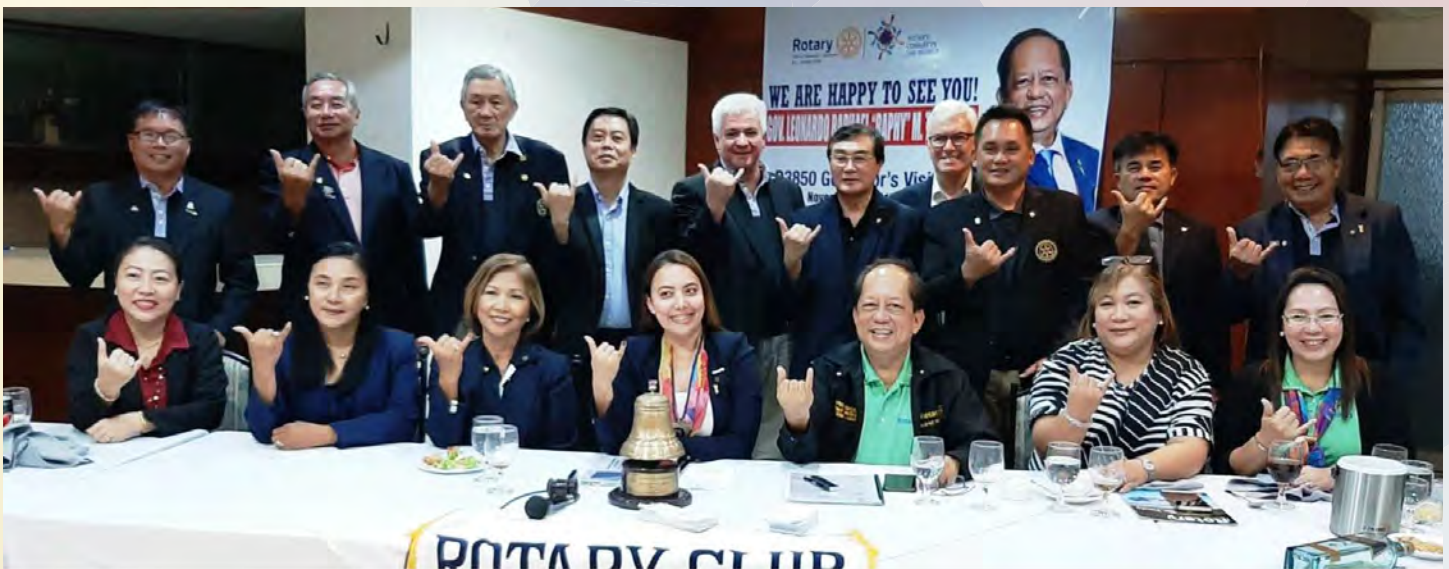
November 18, 2019 - Rotary Club of Bacolod Marapara