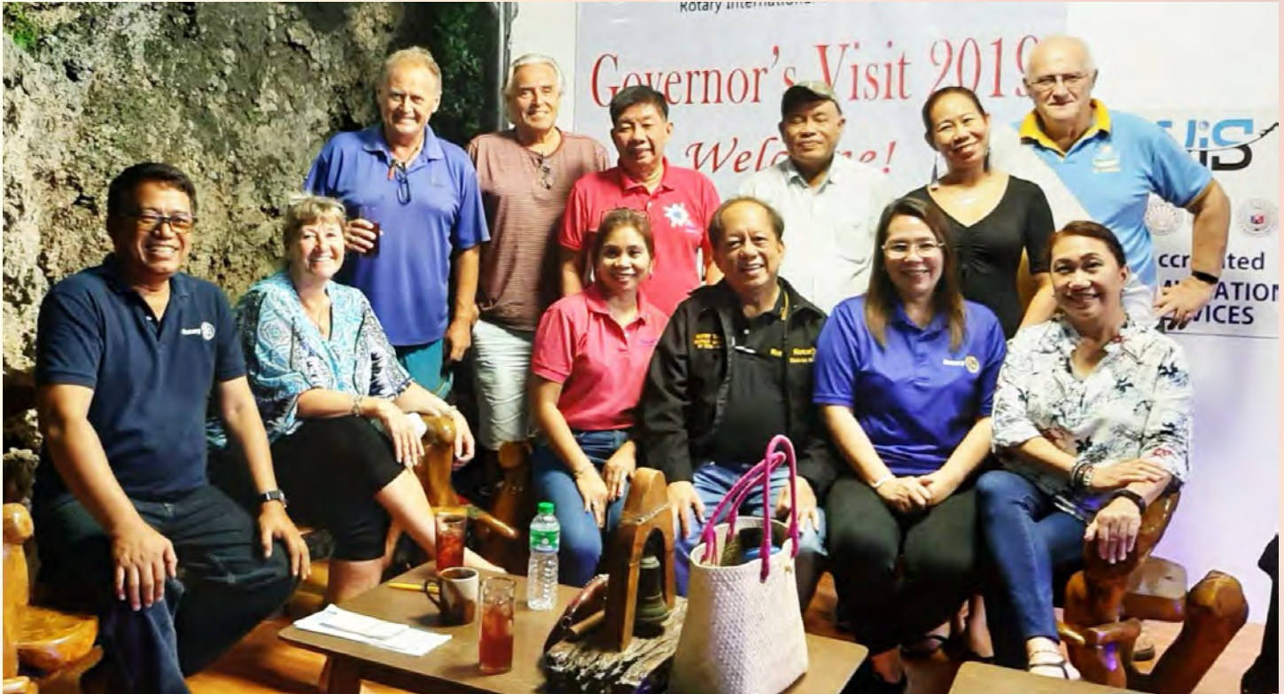
November 15, 2019 - Rotary Club of Boracay