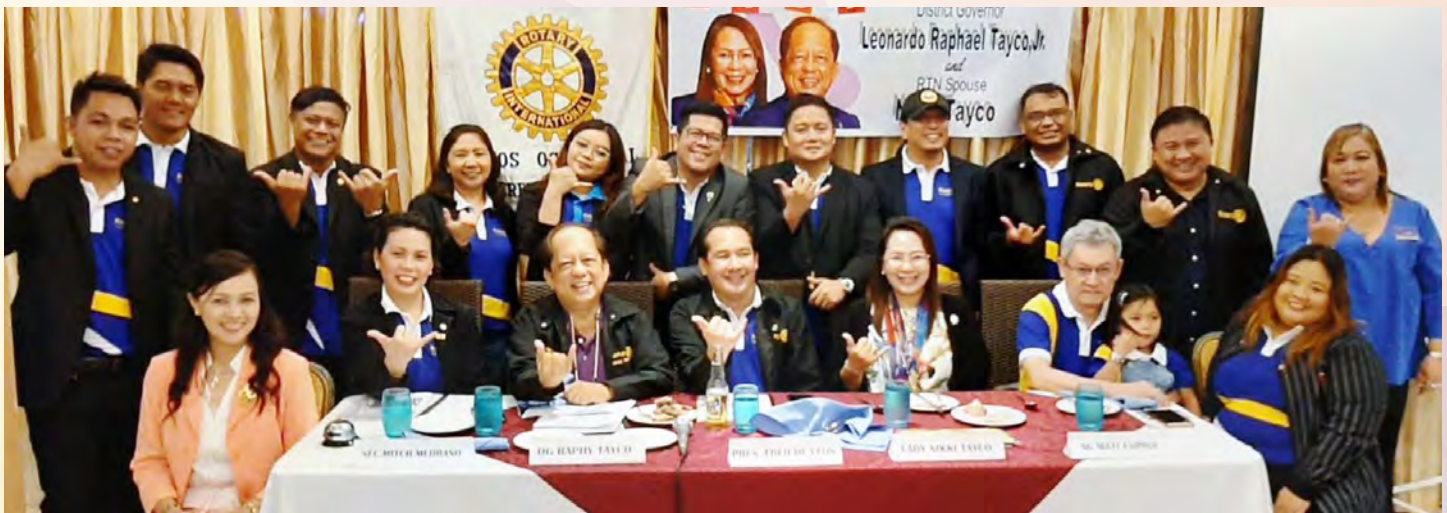
November 21, 2019 - Rotary Club of Bacolod