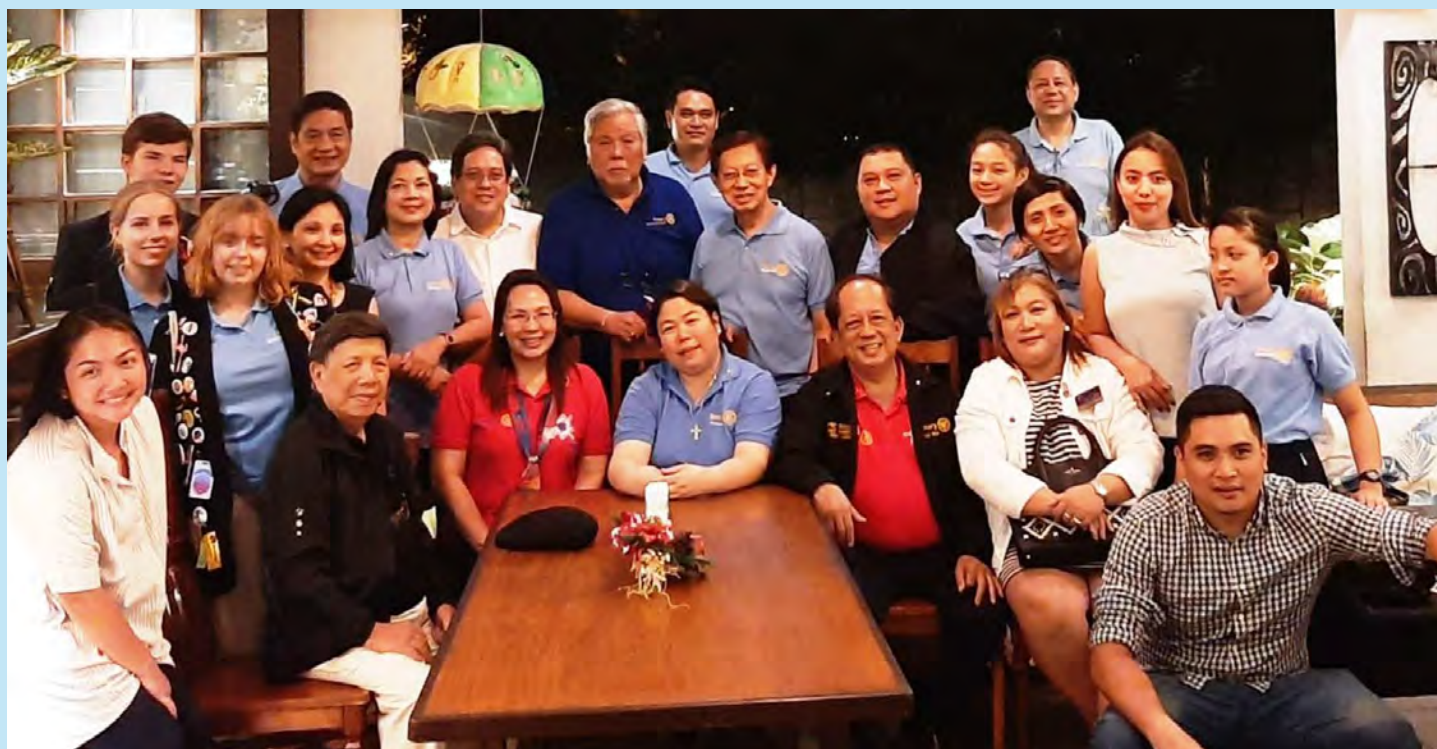
November 19, 2019 - Rotary Club of Bacolod East