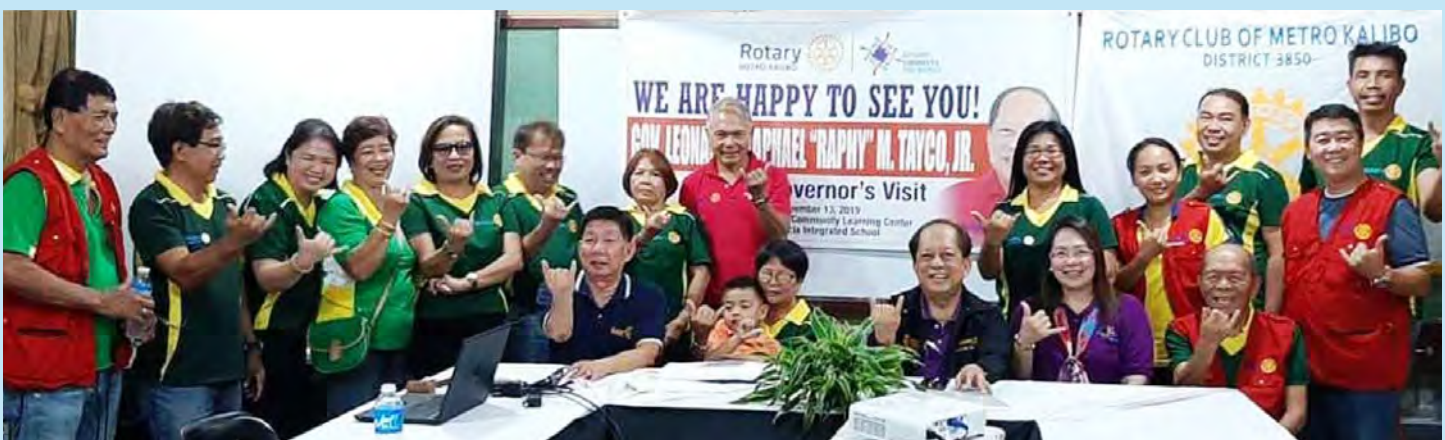
November 13, 2019 - Rotary Club of Metro Kalibo