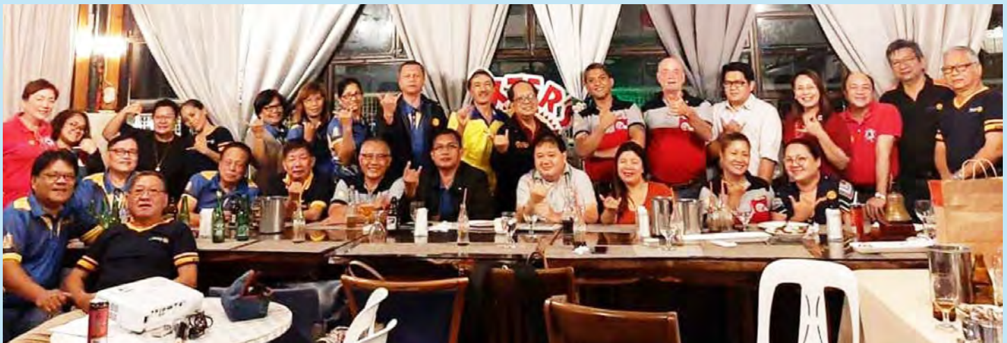
November 7, 2019 - Rotary Club of Metro Roxas