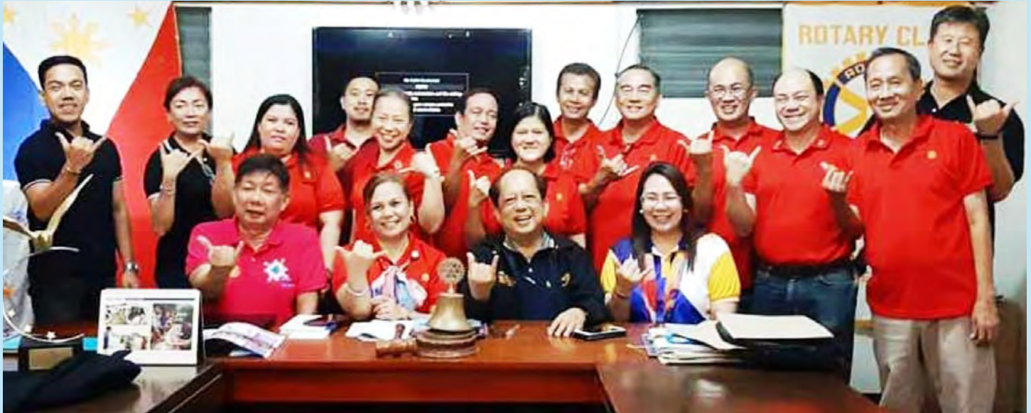
November 6, 2019 - Rotary Club of Roxas