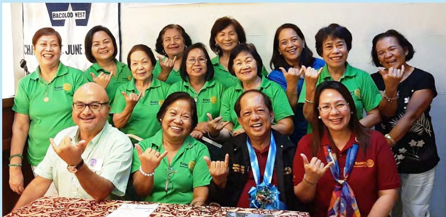
November 18, 2019 - Rotary Club of Bacolod West