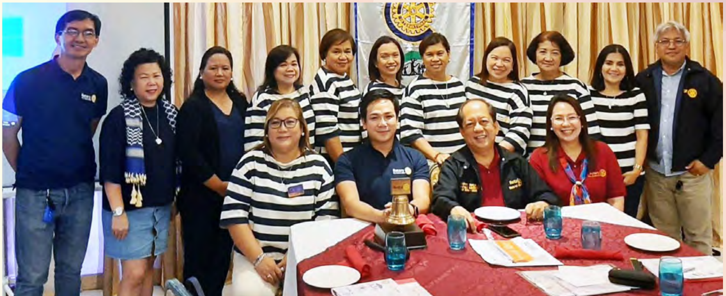
November 20, 2019 - Rotary Club of Bacolod Central