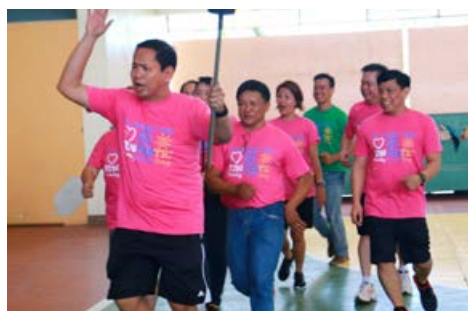
Zones 1, 2, & 3 Joint Governor's Address and Funtastic Family Sports Day 2016 at Ateneo de Iloilo last Nov 12, 2016