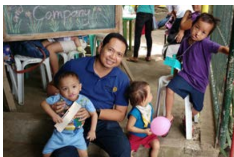
Z9 - RC Ozamiz North