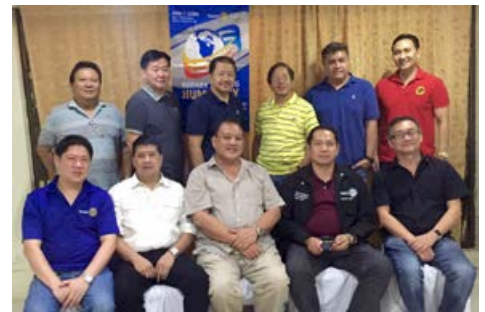
Z3 - RC Molo