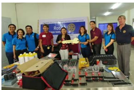
Z8 - RC Dipolog