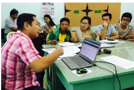
Z2 - RC Jaro Centraline