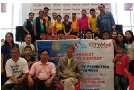
Z4 - RC Metro Kalibo