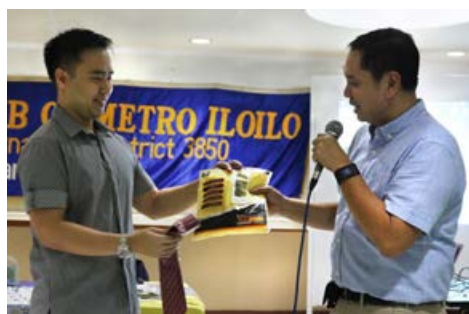
Z3 - RC Metro Iloilo