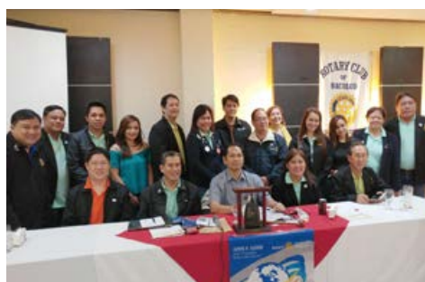
Z6 - RC Bacolod