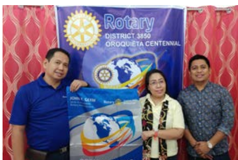
Z8 - RC Oroquieta Centennial