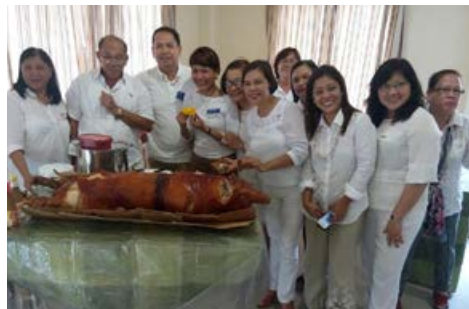
Z1 - RC Guimaras