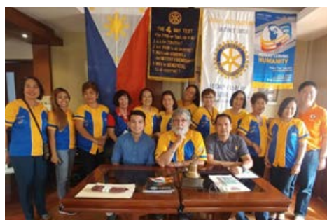
Z4 - RC Metro Roxas Central