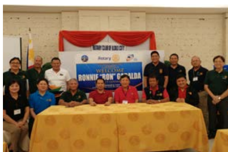
Z2 - RC Iloilo City