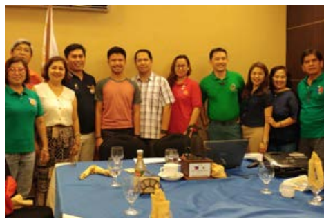
Z1 - RC Iloilo South