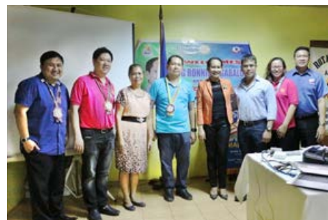
Z1 - RC Antique