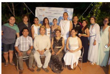
Z8 - RC Dapitan City