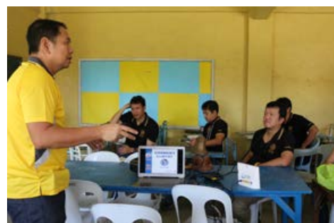
Z2 - RC Jaro South