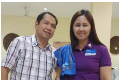
Z2 - RC Central Iloilo City