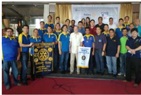
Z10- RC Zamboanga City