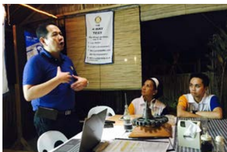
Z5 - RC Silay