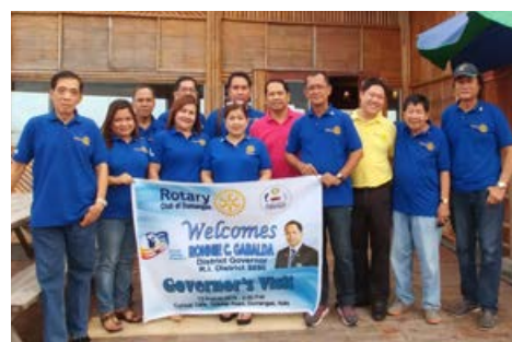
Z3 - RC Dumangas