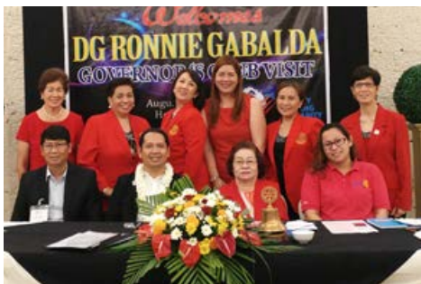
Z1 - RC Iloilo