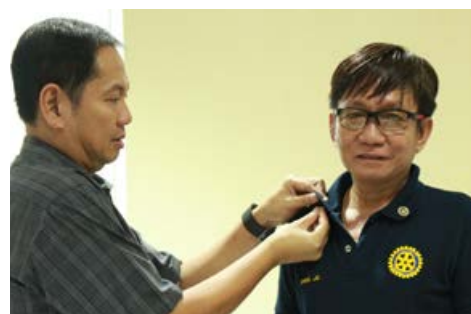
Z3 - RC La Paz