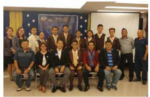
Z10 - RC Zamboanga City East