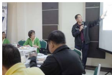
Z7 - RC Bacolod West