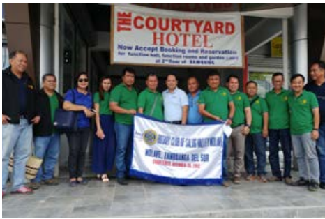
Z9 - RC Salug Valley Molave