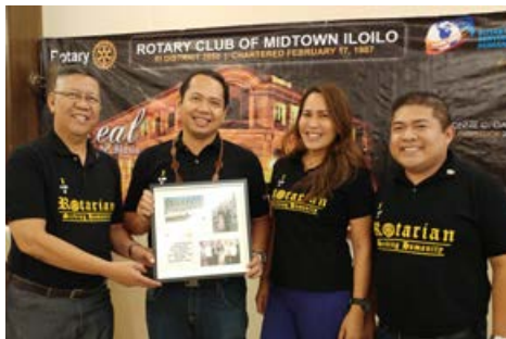
Z3 - RC Midtown Iloilo