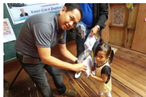
Z9 - RC Pagadian West