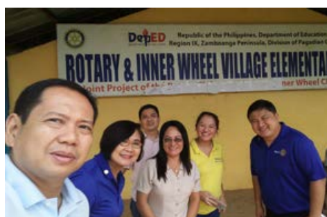
Z9 - RC Pagadian