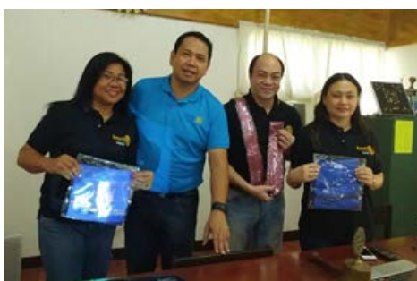
Z4 - RC Roxas