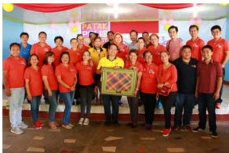
Z11 - RC Bongao Tawi-tawi