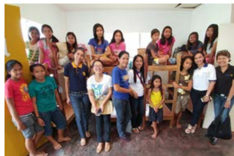
Z11 - RC Ipil Sibugay