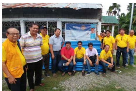
Z4 - RC Kalibo