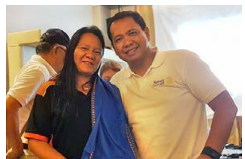
Z4 - RC Metro Roxas