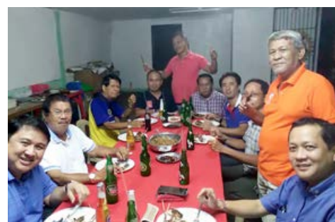
Z5 - RC Victorias