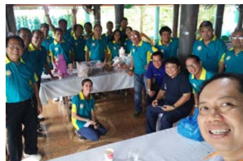
Z5 - RC Escalante