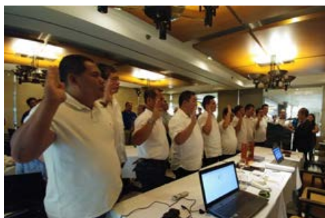
Z5 - RC Bacolod North