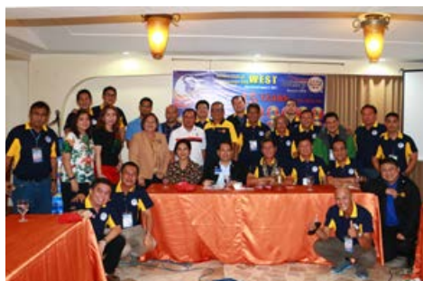
Z11 - RC Zamboanga City West