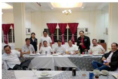
Z2 - RC Jaro-Iloilo City