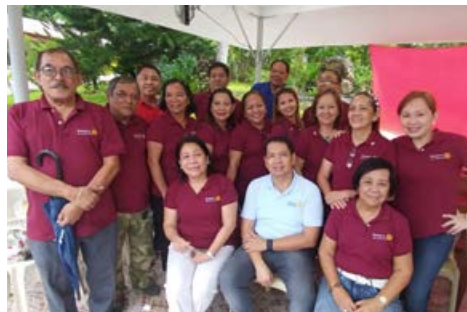
Z3 - RC Metro Passi