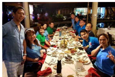
Z4 - RC Boracay