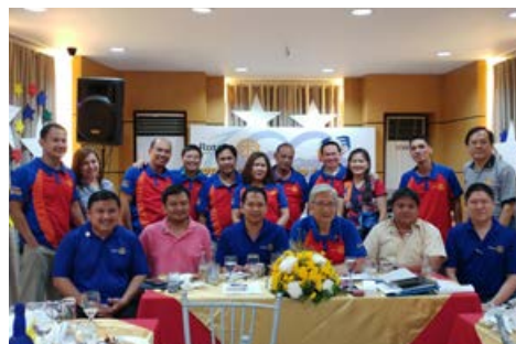
Z11 - RC Metro Zamboanga