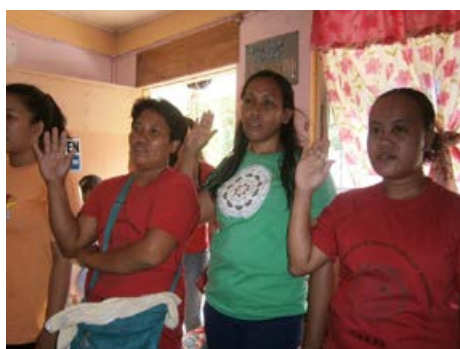
RCC Agustin Navarra Ivisan Capiz Induction Sponsor- Metro Roxas Central

RCCs are indeed one of the directions your club needs to go in and it's never too late to get started!!