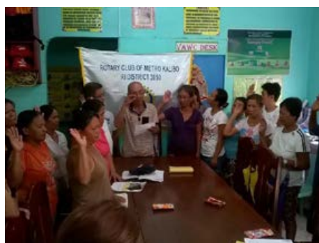
RCC Jawili Aklan –Sponsor Metro Kalibo