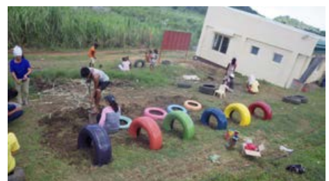
A playground for Ati children in Brgy. Dacal, San Enrique, Iloilo