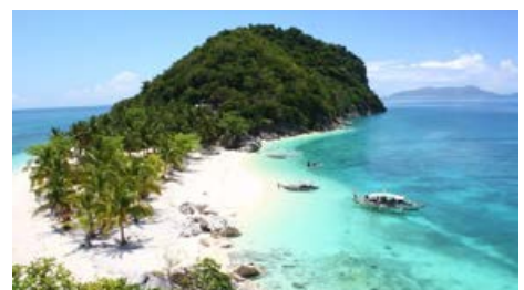
Isla de Gigantes, Carles, Iloilo