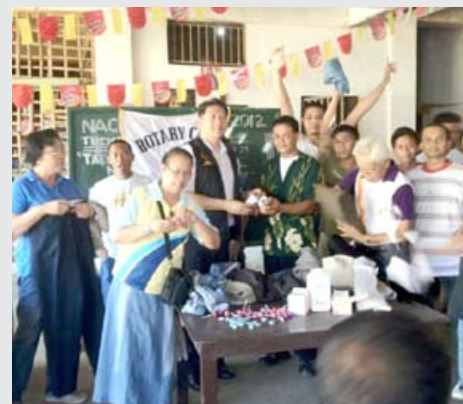
RC Antique Spiritual Outreach at Antique Provincial Jail with clothes & medicines donation catering to 120 inmates last Nov. 10, 2012.