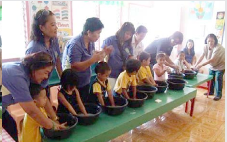
Rotary Club of Oroquieta Centennial "Loving Care for Day Care" Literacy Program & Book Giving Activities last October 20, 2012.