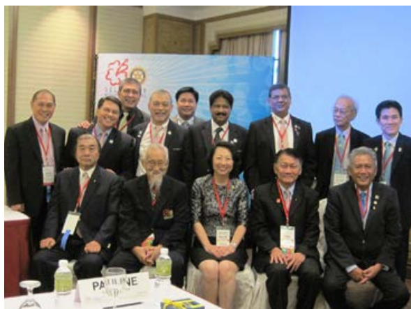
District Governors RY2012-2013