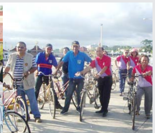
Distribution of Bikes for Peace: Saturday, November 17, 2012 4PM at Paseo del Mar, Zamboanga City.