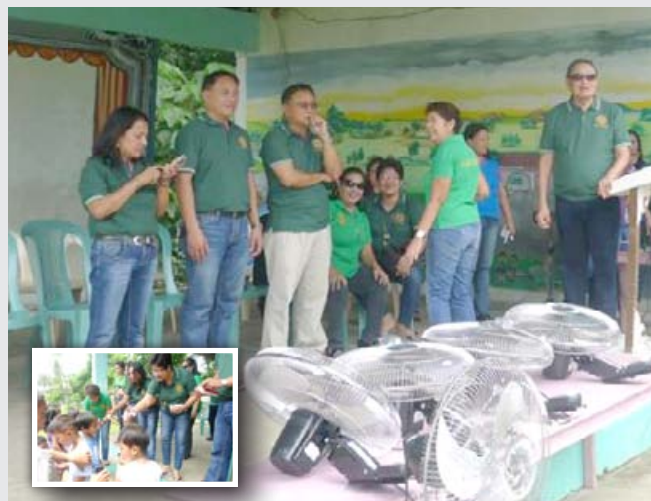
RC Iloilo South turnover of 5 wall fans and 2 standing fans plus Yakult distribution. Recipient school: Mambatad Bacauan Elem. School, Miag-ao.