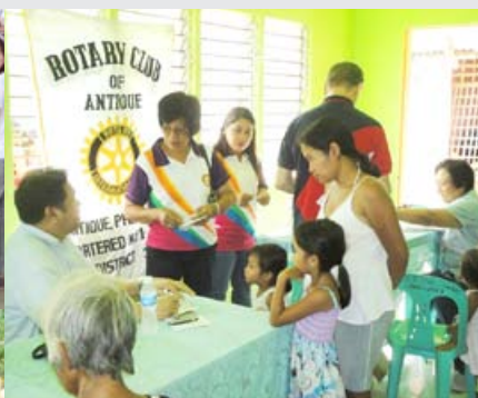
RC Antique Medical & Dental Mission Outreach at EBJ, Hamtic, Antique catering to 250 patients last Oct. 30, 2012; and Medical Outreach at Tobias Fornier, Antique catering to 500 patients last Nov. 12, 2012.