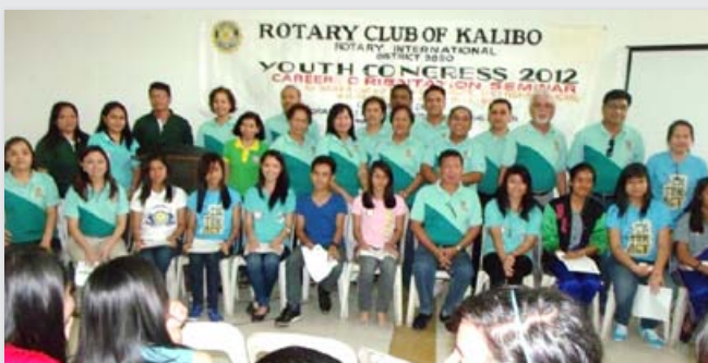
Participants and some of the speakers in the Rotary Club of Kalibo Youth Congress Career Orientation Seminar on October 20, 2012.