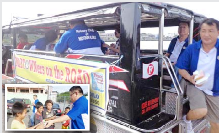
Jeep sang Rotary of the Rotary Club of Midtown Iloilo