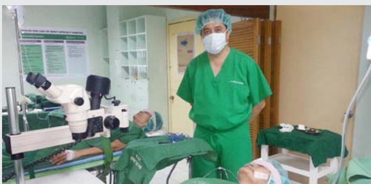
An eye doctor's work is endless! Operations day for Rotary Club of Bacolod East Community Eye Program.