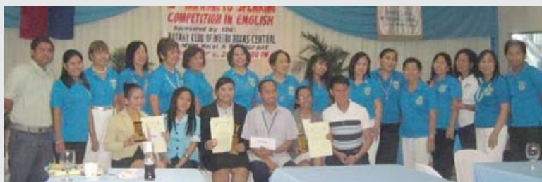
The Rotary Club of Metro Roxas Central conducted the 3rd Impromptu Speaking Competition – Club elimination last November 6, 2012.