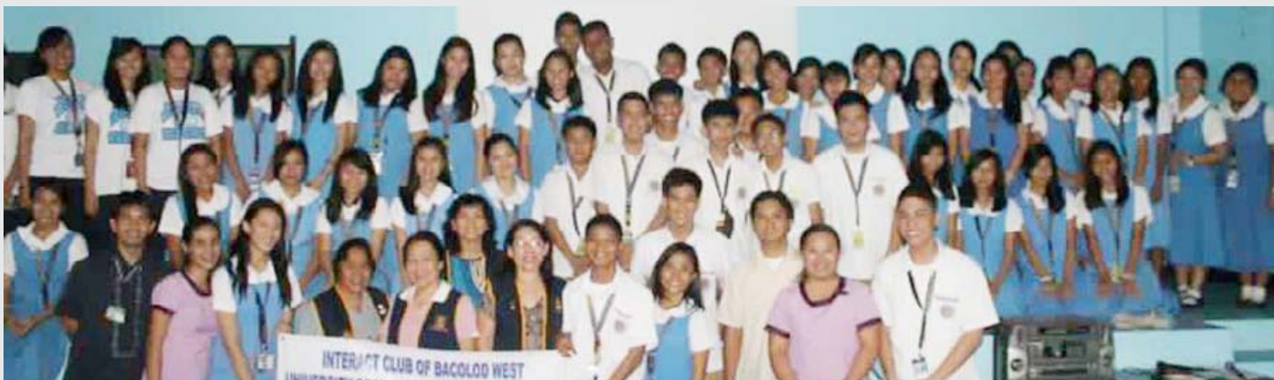
Rotary Club of Bacolod West inducts Interact-UNOR Chapter.