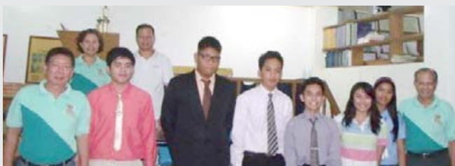
The Rotary Club of Kalibo held a Club Level Elimination of the "Voice of Our Youth 12th National Impromptu Speaking Competition" at the Rotary Livelihood and Training Center.