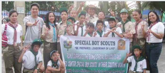
Rotary Club of Metro Bacolod supports the Bacolod City National High School Special Boy Scouts for Jamboree last Oct. 1, 2012.