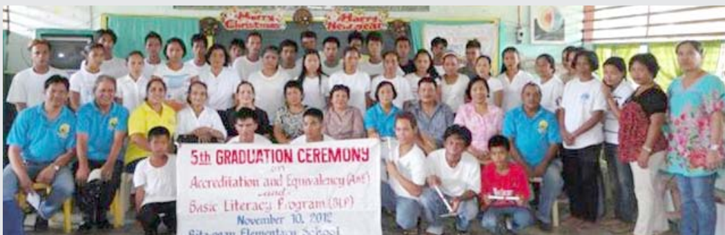
Graduation Ceremony of Alternative Learning System (ALS) by The Department of Education, Division of Passi City and the Rotary Club of Metro Passi as the Service Provider. Held at Brgy. Bitagan, Passi City on Nov. 10, 2012. The Learners are from Brgy. Bitagan and Brgy. Sto. Tomas.