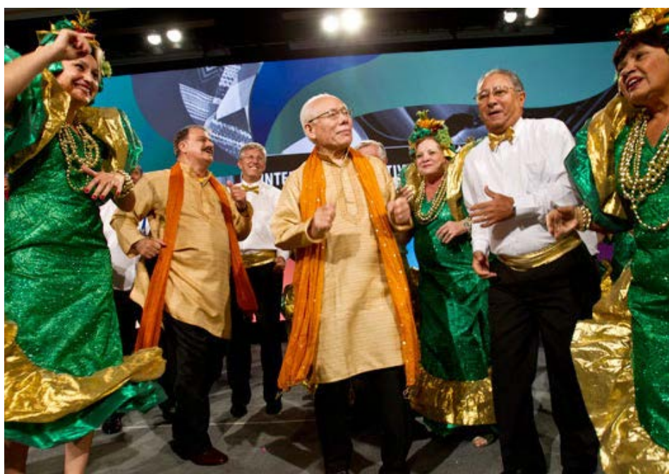
Celebrating at the 2012 International Assembly.