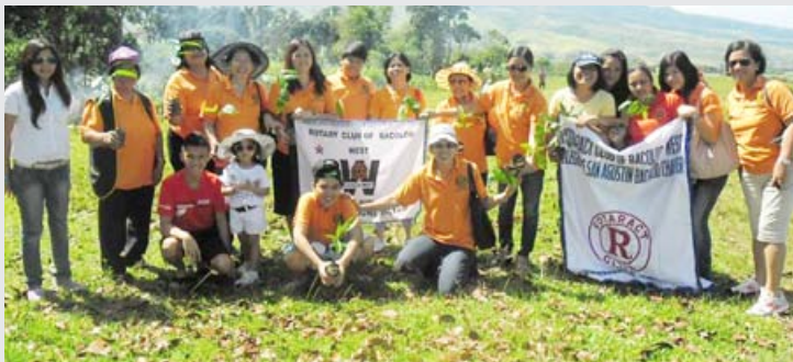
RC Bacolod West Tree planting together with RCBW Rotaract.