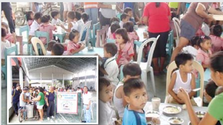
RC Dumangas Children's Party for the children of Brgy. Sulangan Day Care Center, Dumangas last October 22, 2012.