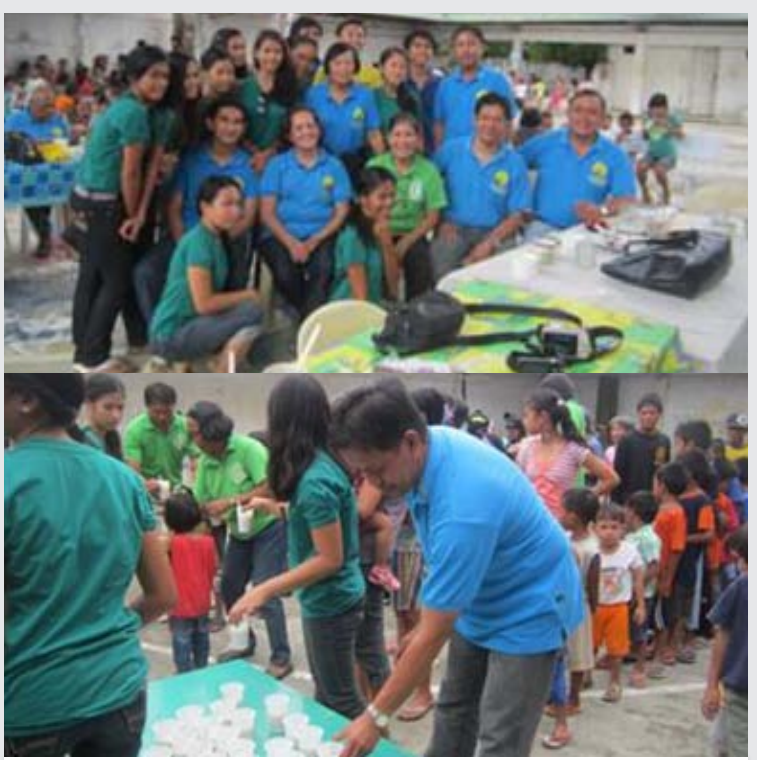
Rotary Club of Metro Passi: Outreach Program for Senior Citizens and Children (Feeding Program) at Brgy. Agdahon, Passi City.