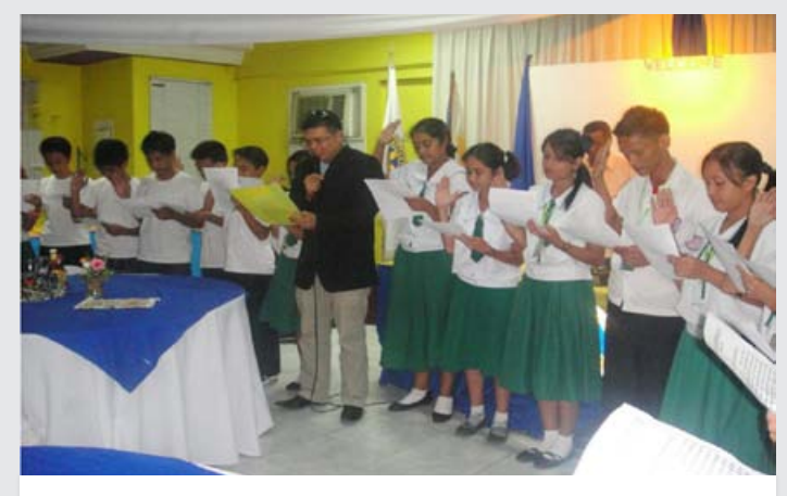
Rotary Club of Pagadian West SMC High School Main.