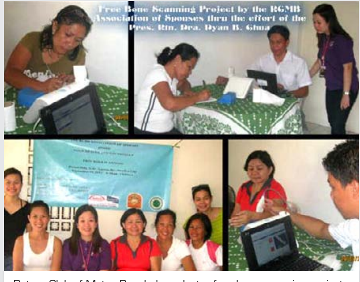
Rotary Club of Metro Bacolod conduct a free bone scanning project.