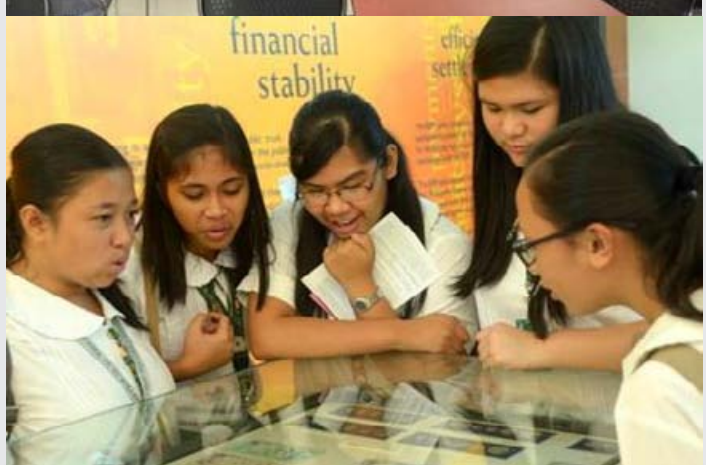
Rotary Club of Roxas: Fun Run; hosted the Boys & Girls Week on Sept. 28 - Oct. 4; and conducted vocational visit to Bangko Sentral.