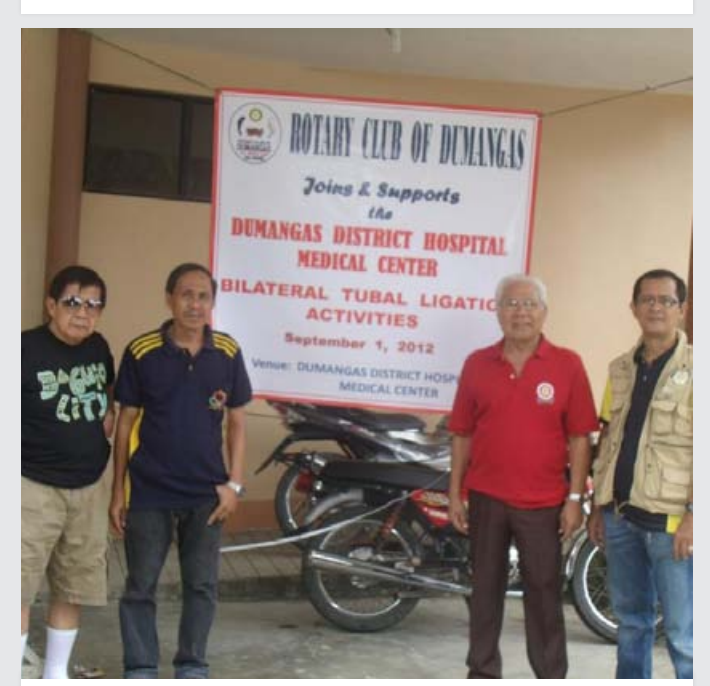
Rotary Club of Dumangas supported the Bilateral Tubal Ligation Activities together with Dumangas District Hospital Medical Center on September 1, 2012.