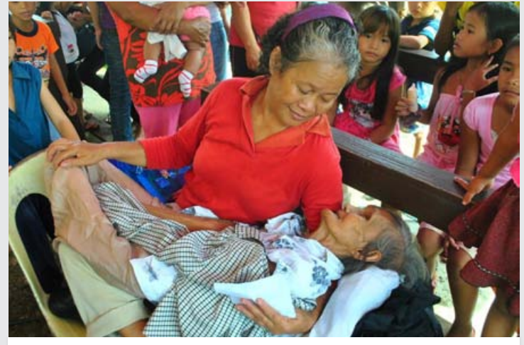
Rotary Club of Ipil-Sibugay: 4th San Roque Medical Outreach on August 15, 2012.