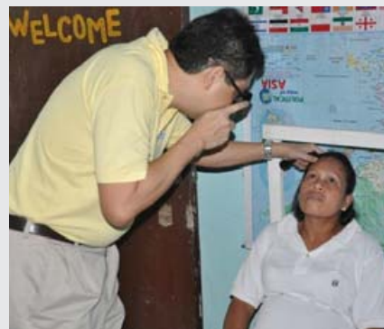
RC Bacolod East launched its Community Eye Program in Brgy. Alangilan to provide continuous free eye clinics to the 61 baranggays of Bacolod City, serving the indigent population and poor senior citizens who need to see a trained eye doctor. Free checkups, glasses, and eye surgery will be provided.