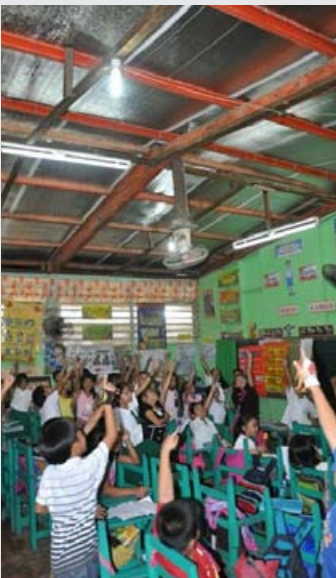
Elementary students show off their new roof with the help of the Rotary Club of Bacolod East's 'School Repair' program.