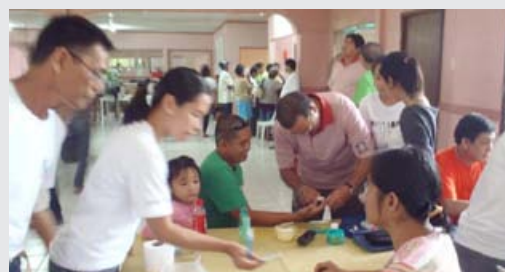
RC Bacolod Marapara Medical & Dental Mission at Binalbagan Negros Occidental, together with Rotaractors.