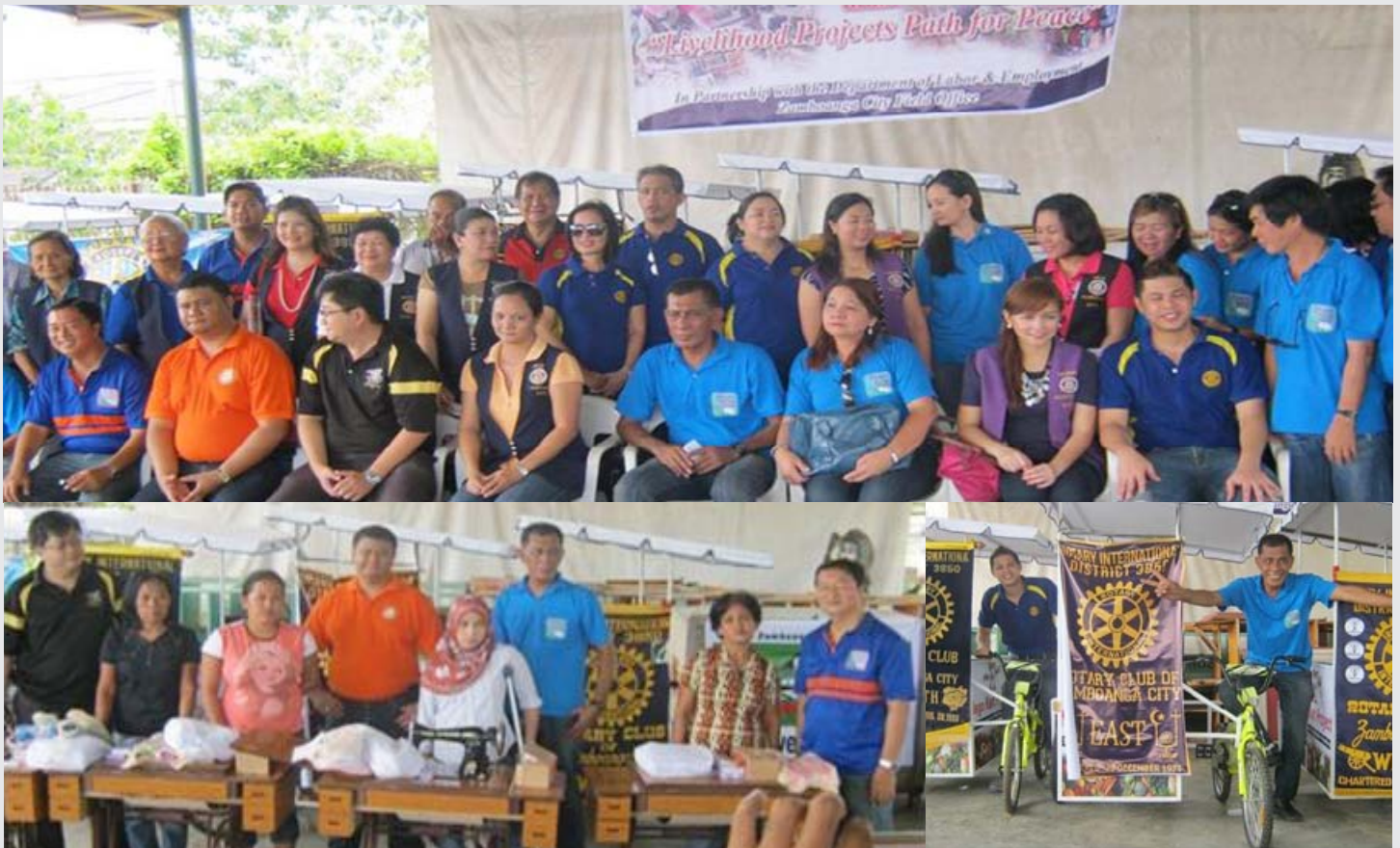
Rotary Clubs of Zamboanga City "Livelihood Projects Path for Peace".