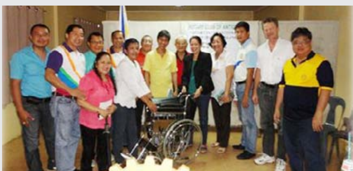
Rotary Club of Antique donates wheelchair.