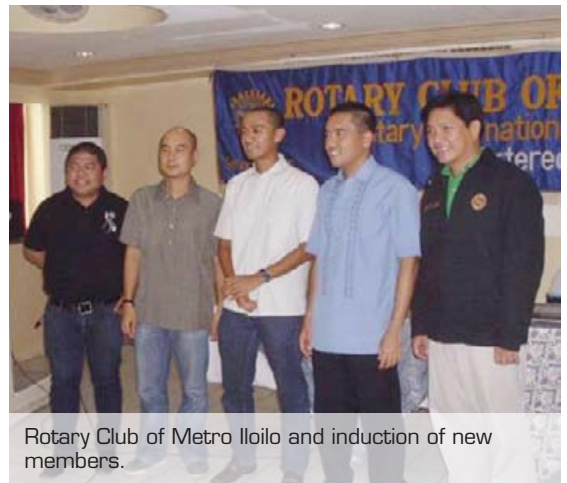
Rotary Club of Metro Iloilo and induction of new members.