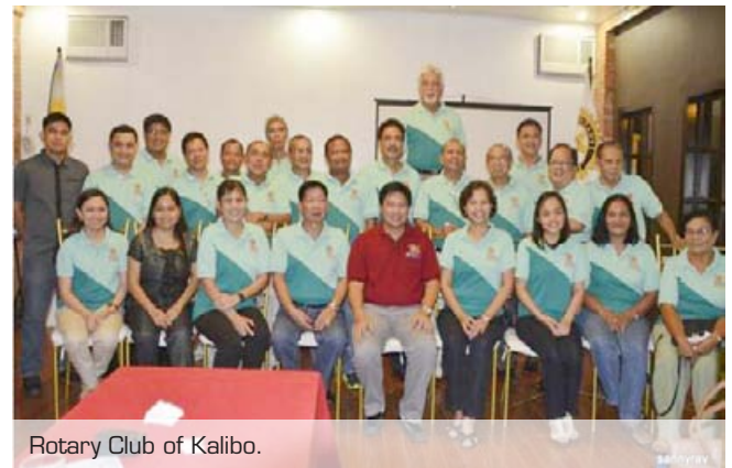
Rotary Club of Kalibo.