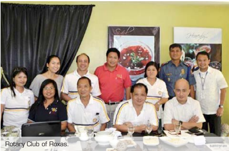
Rotary Club of Roxas.