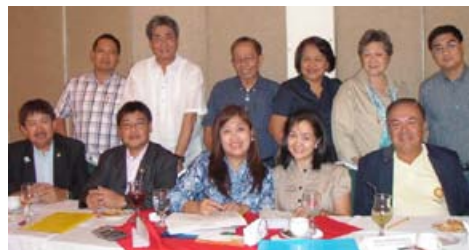
The GSE Screening Panel of Judges