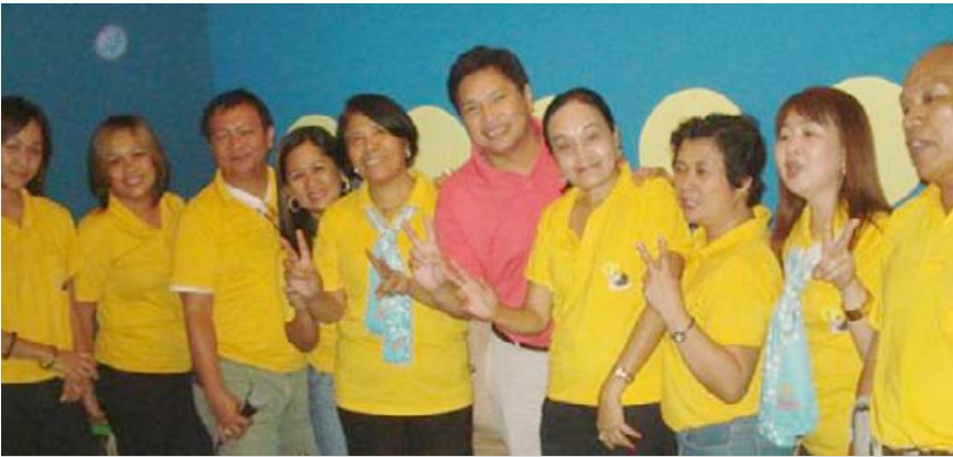
Rotary Club of Central Iloilo City Club Visit and fellowship with the Governor.