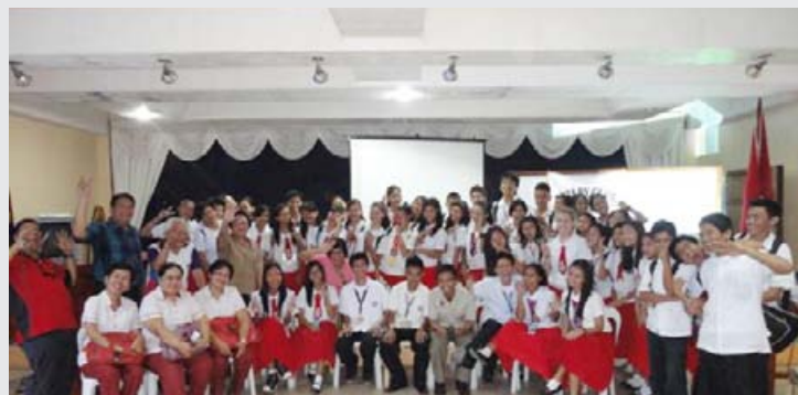
RC Antique organized and oriented the Interact Club of Antique National School.