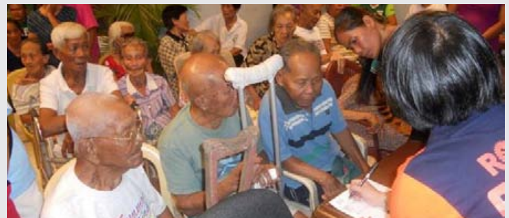
RC Bacolod South Feeding Program and Wheelchair Assessment.