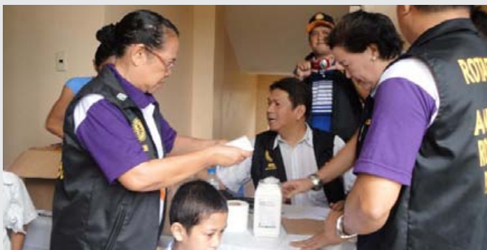
Rotary Club of Antique: Deworming the Children with Disabilities at SPED of San Jose, Antique.