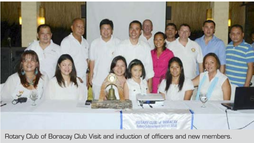
Rotary Club of Boracay Club Visit and induction of officers and new members.