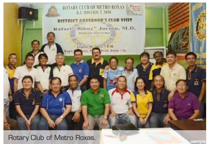
Rotary Club of Metro Roxas.