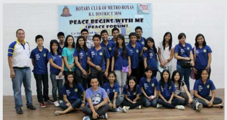
PEACE FORUM. RC Metro Roxas last Sept 1, 2012.