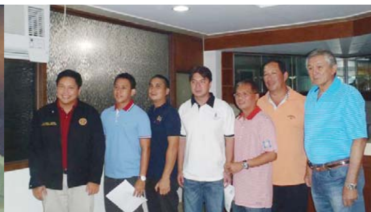
Rotary Club of Bacolod-Marapara inducted 3 new members during their Club Visit last Sept. 5, 2012.