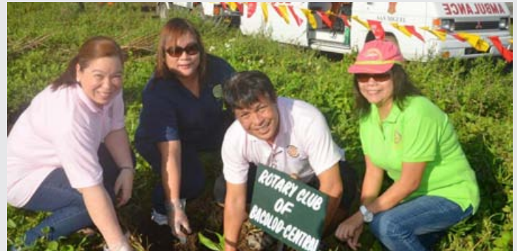
Rotary Club of Bacolod Central Tree planting project.