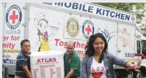
RC Iloilo South Oplan Sagip Luzon project together with Rotaractors.