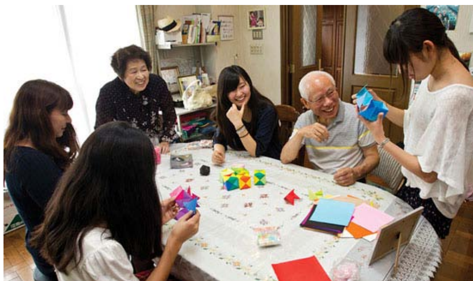
The president at home watching his grandchildren create origami.