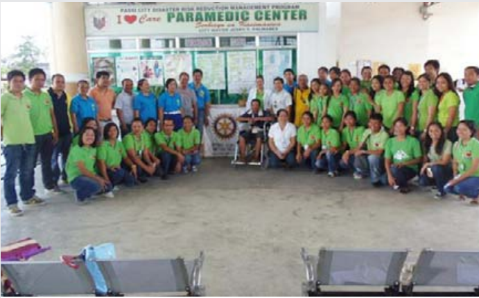
RC Metro Passi turning over a wheelchair to the I Care Paramedic Center of Passi City with their doctors and staff.