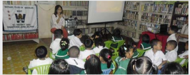
RC Bacolod West celebrated New Generations Month by conducting 'Storytelling to Preschoolers' project.