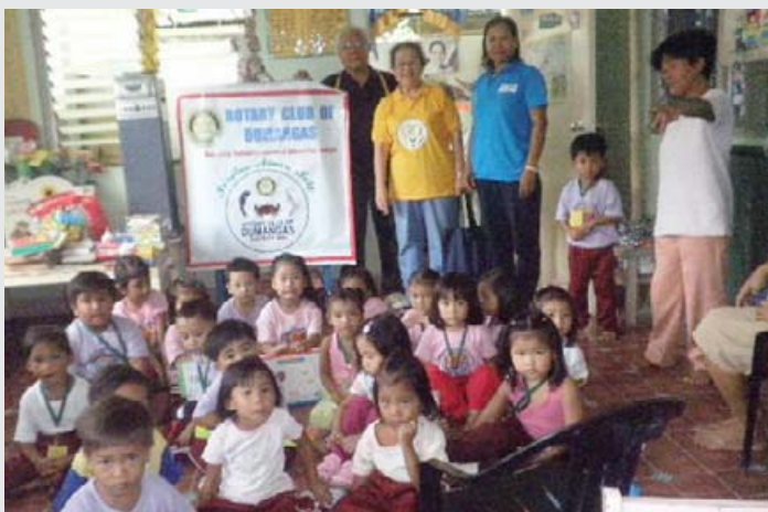
RC Dumaguas distributed School supplies for Monfort North Day Care Center and donated a wheelchair.