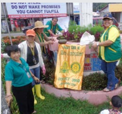
Rotary Club of Jaro Centraline and Rotaract Club of Jaro Centraline together with the CPU ROTC Unit Cadet Officers helped hand in hand in cleaning up RCJC's Monument located at Aganan, Pavia, Iloilo last September 9, 2012 to celebrate RCJC's 19th Charter Day.