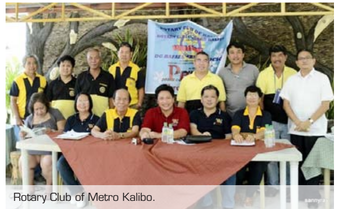
Rotary Club of Metro Kalibo.