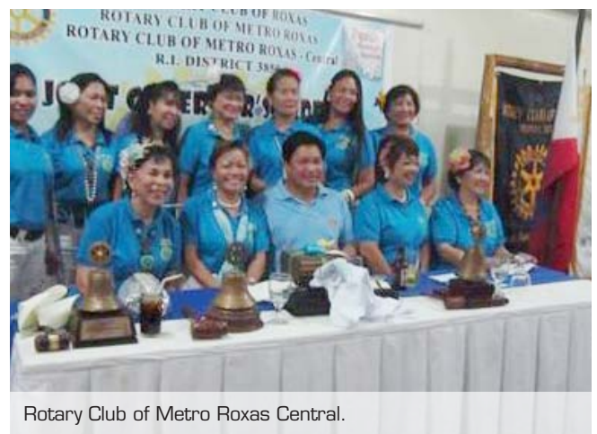
Rotary Club of Metro Roxas Central.