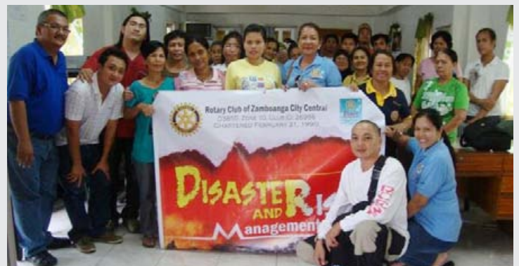
Rotary Club of Zamboanga City Central.