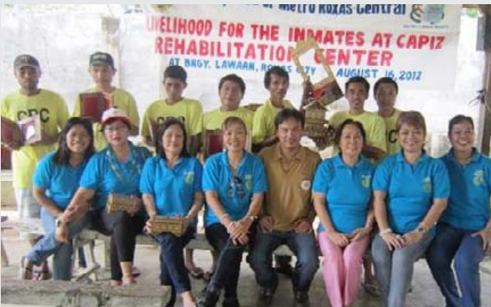
RC Metro Roxas Central 'Rehabilitation Livelihood' project for inmates.