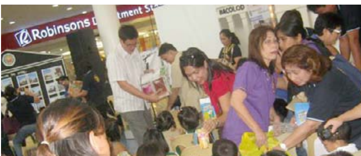
Story Telling Project : A joint project of the RC Bacolod & RC Bacolod-West in cooperation with Bacolod City Public Library, held at Robinsons Place Bacolod on July 11, 2012.