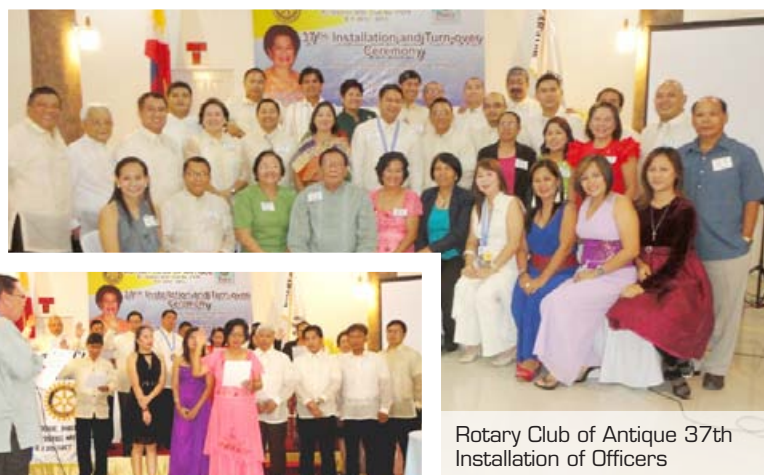
Rotary Club of Antique 37th Installation of Officers