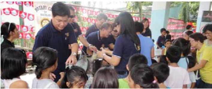
Rotary Club of Bacolod feeding of the children in Brgy. Banago last June 30, 2012. This is a yearly activity of all clubs in Rotary as opening salvo prior start of the Rotary Year on July 1, 2012.