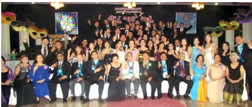
July 7, 2012: RC Zamboanga City West with Pres. Santi Araneta.