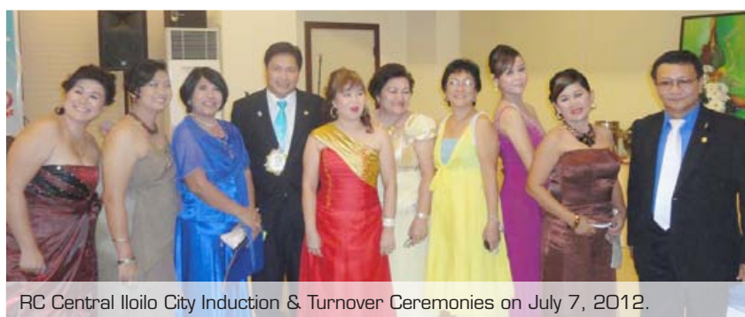
RC Central Iloilo City Induction & Turnover Ceremonies on July 7, 2012.