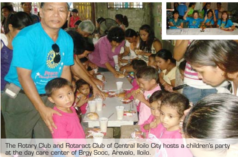
The Rotary Club and Rotaract Club of Central Iloilo City hosts a children's party at the day care center of Brgy Sooc, Arevalo, Iloilo.