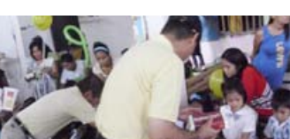
Rotary Club of Metro Iloilo hosts a McDonald's Children's Party at Sta. Luisa Day Care Center, Arevalo, Iloilo City.