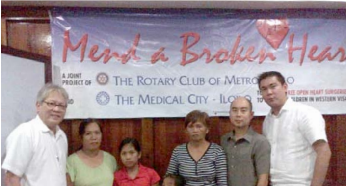
Mend a Broken Heart Project. Two of the 6 children with PDA (patent ductus arteriosus) to undergo heart operation in July, made possible by this RC Metro Iloilo flagship project for RY 2012-2013.