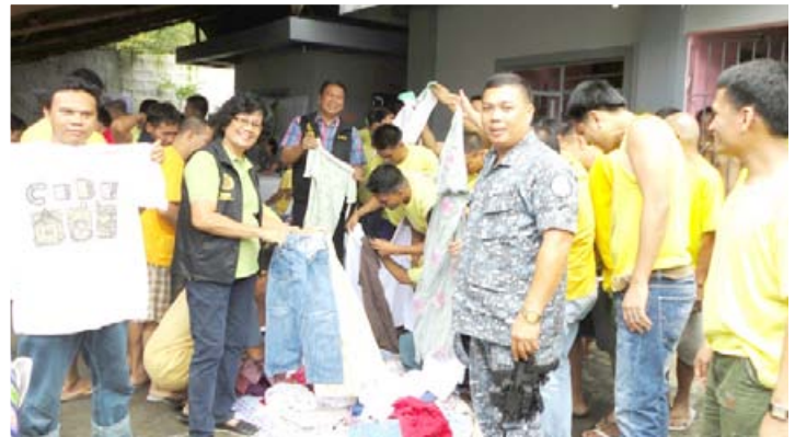
RC Antique's Peace Project: Medical & Dental Outreach, Deworming and Distribution of Clothings for Inmates of Bureau of Jail Management and Penology, San Jose, Antique