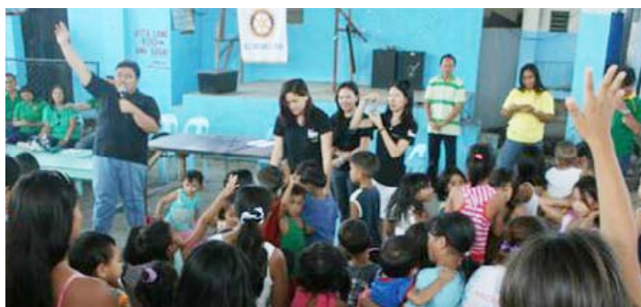
RC Iloilo South: A joint Children's Party, Story Telling, Magical Entertainment & Feeding project of the Rotary Club of Iloilo South and the Rotary Anns & Rotaract Club of Iloilo South. Support Groups who joined were the GK I Love Iloilo Team (story telling & games) and the Street Magic Club of Iloilo (performed magical entertainment). July 01, 2012 at Brgy. Tanza-Esperanza multi-purpose covered Gym.