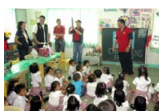
RC Antique's Children's Party at Atabay Day Care Center, Atabay, San Jose, Antique.