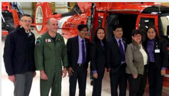
U.S. Coast Guard Air Station Group North Bend