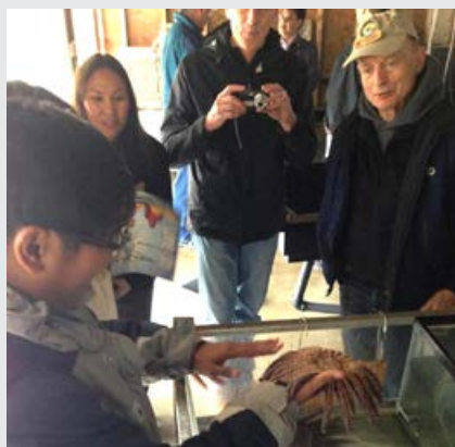
Handling a starfish at the Oregon Institute of Marine Biology, Charleston, Oregon.