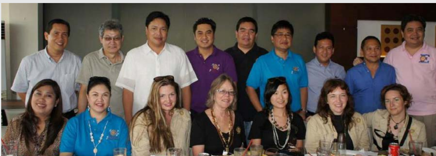
Bacolod / Negros Occidental