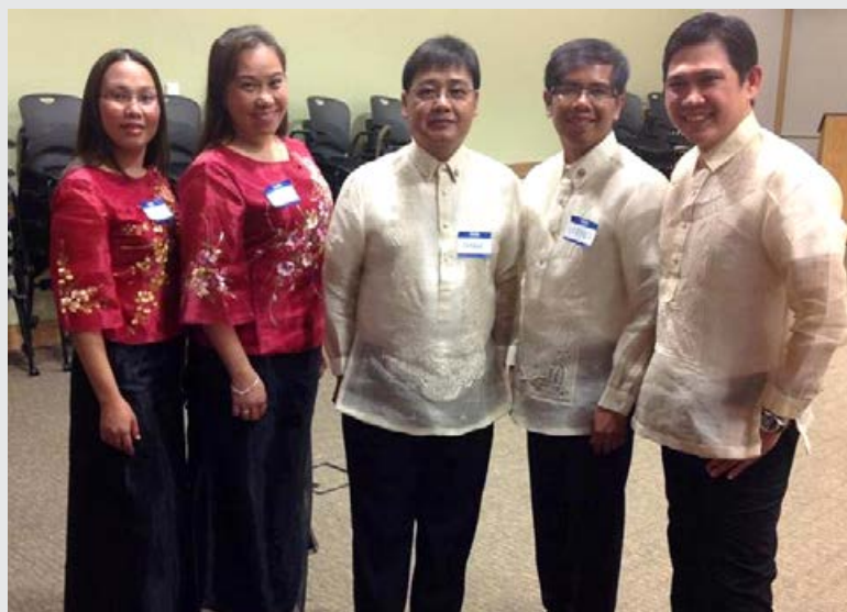
Attending a party hosted by Rotary Clubs in Bend, Oregon, RC Mt. Bachelor, RC High Desert, RC Bend and RC Greater Bend.