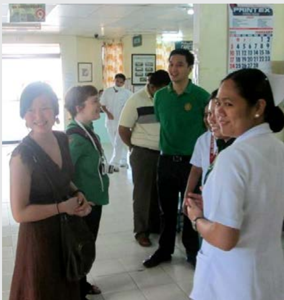
Vocational Tour in Zamboanga City