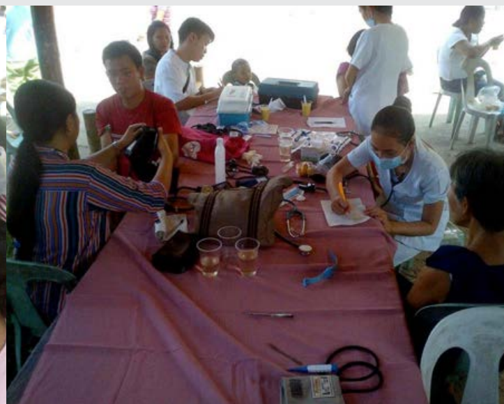
Rotary Council of Presidents Zone 1, 2 and 3 & RC Iloilo West joint Medical/Dental Mission on February 24, 2013.