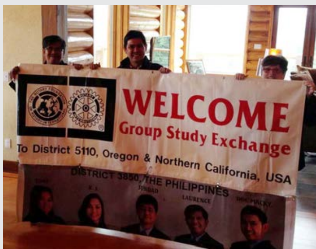
DISCON 2013 of District 5110