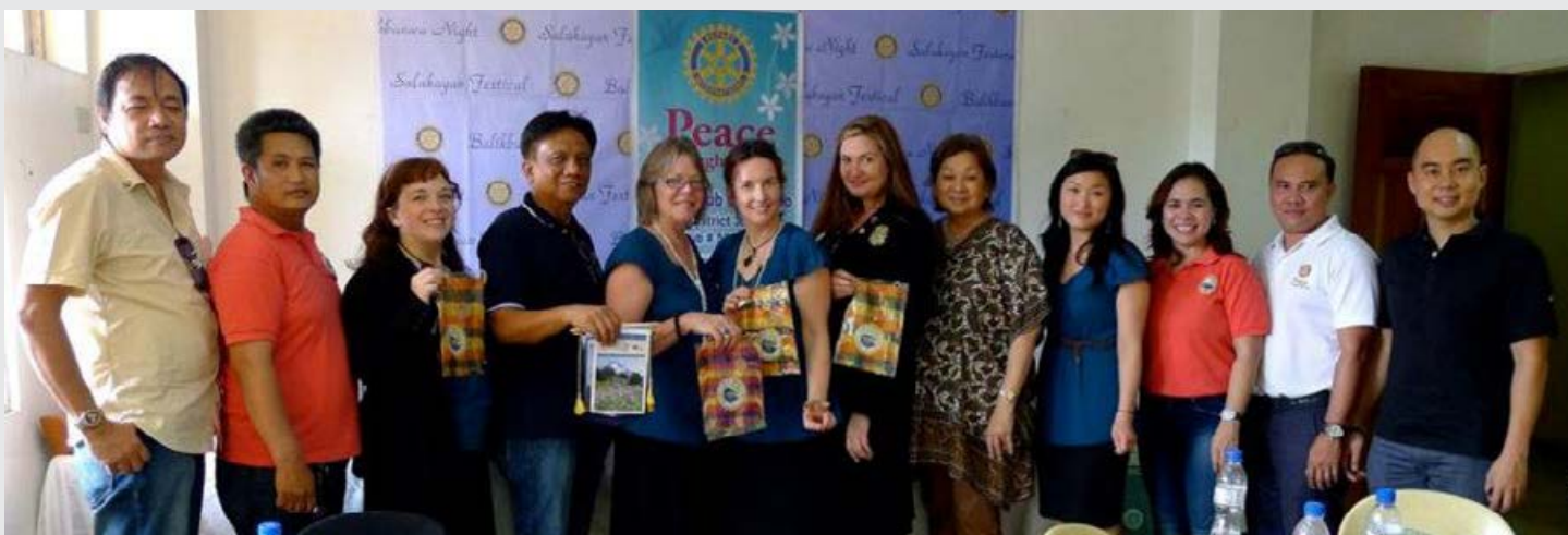
Iloilo / Panay