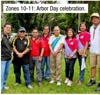
Zones 10-11: Arbor Day celebration.