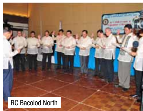
RC Bacolod North