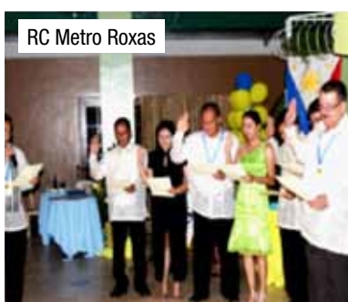
RC Metro Roxas