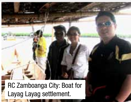
RC Zamboanga City: Boat for Layag Layag settlement.