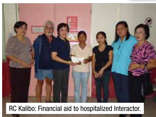
RC Kalibo: Financial aid to hospitalized Interactor.