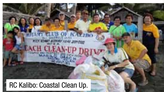
RC Kalibo: Coastal Clean Up.