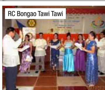
RC Bongao Tawi Tawi