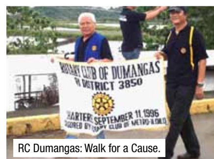
RC Dumangas: Walk for a Cause.