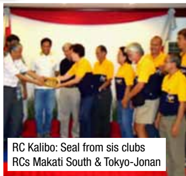
RC Kalibo: Seal from sis clubs RCs Makati South & Tokyo-Jonan