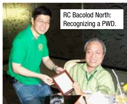
RC Bacolod North: Recognizing a PWD.