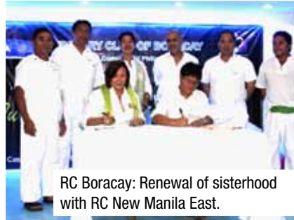
RC Boracay: Renewal of sisterhood with RC New Manila East.