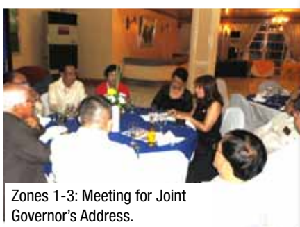
Zones 1-3: Meeting for Joint Governor's Address.