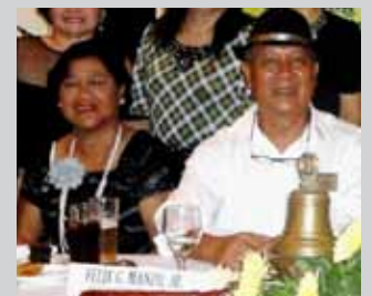
With spouse Nenet