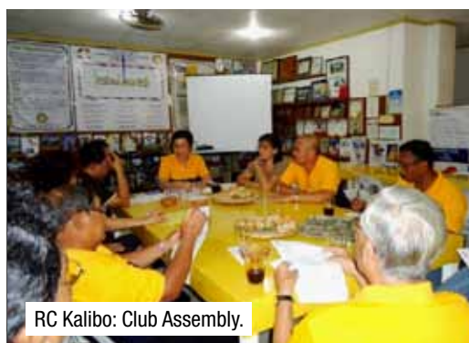
RC Kalibo: Club Assembly.