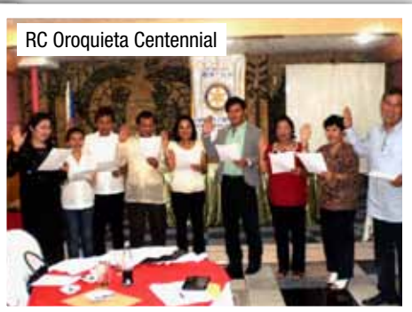
RC Oroquieta Centennial