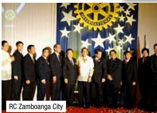
RC Zamboanga City