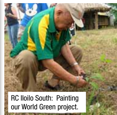
RC Iloilo South: Planting our World Green project.