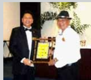
Receiving a token from DG Mel during induction ceremony