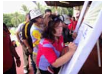
Signing commitment to save Mother Earth on Arbor Day