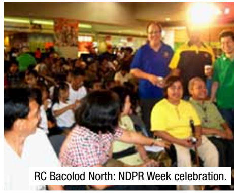
RC Bacolod North: NDPR Week celebration.