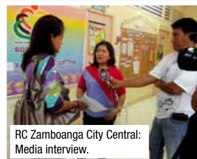
RC Zamboanga City Central: Media interview.