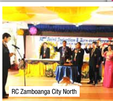
RC Zamboanga City North