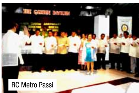
RC Metro Passi