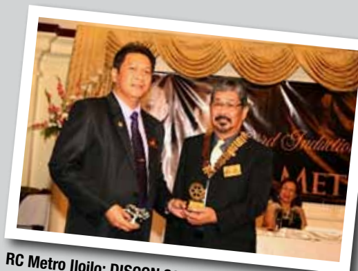
RC Metro Iloilo: DISCON 2012 Early Bird Award