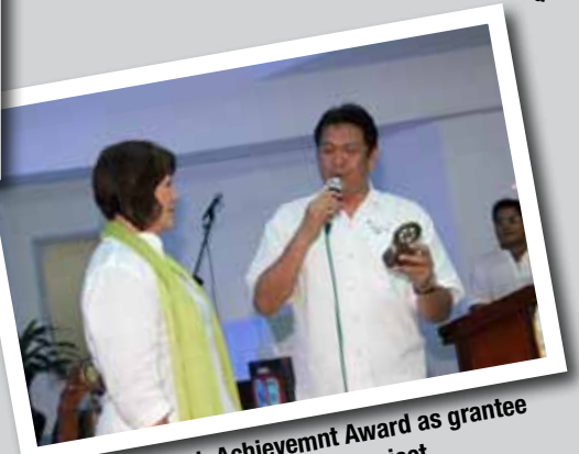
RC Boracay: Club Achievement Award as grantee of R.I. Corporate Member Pilot Project