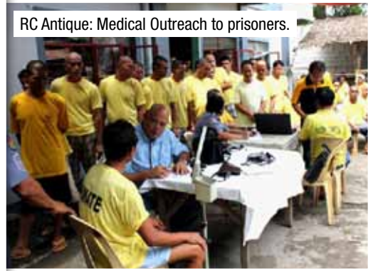
RC Antique: Medical Outreach to prisoners.