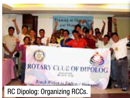
RC Dipolog: Organizing RCCs.