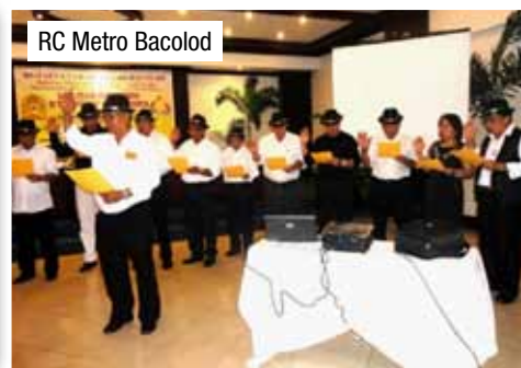
RC Metro Bacolod