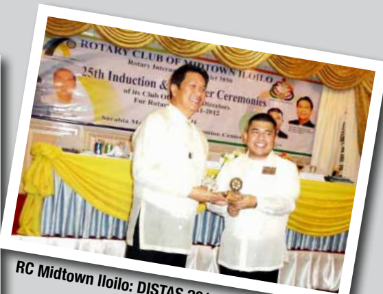
RC Midtown Iloilo: DISTAS 2011 Attendance Award