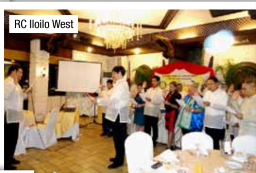
RC Iloilo West