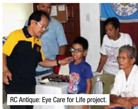
RC Antique: Eye Care for Life project.