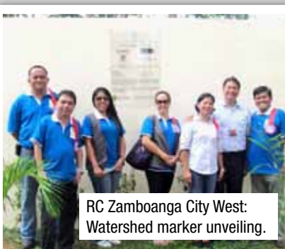
RC Zamboanga City West: Watershed marker unveiling.