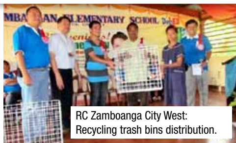
RC Zamboanga City West: Recycling trash bins distribution.