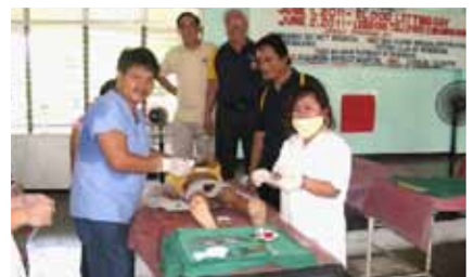
RC Dumangas: Operation Tuli & Blood Letting.