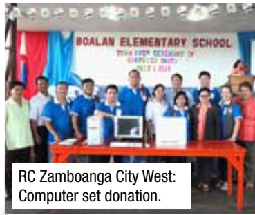
RC Zamboanga City West: Computer set donation.