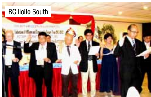
RC Iloilo South