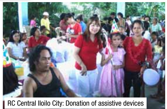
RC Central Iloilo City: Donation of assistive devices