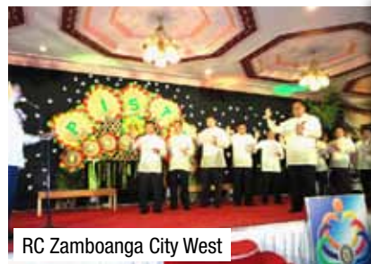
RC Zamboanga City West