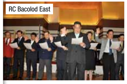
RC Bacolod East