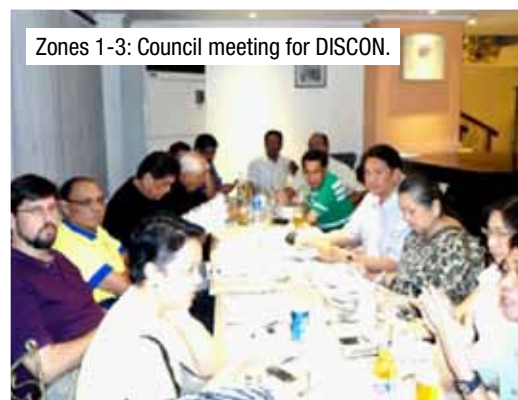
Zones 1-3: Council meeting for DISCON.