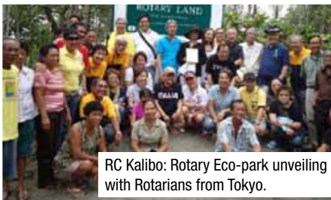
RC Kalibo: Rotary Eco-park unveiling with Rotarians from Tokyo.