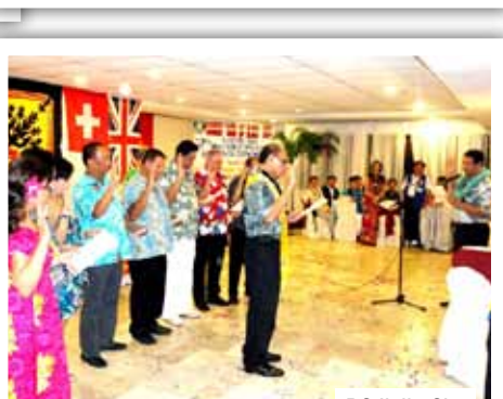
RC Iloilo City