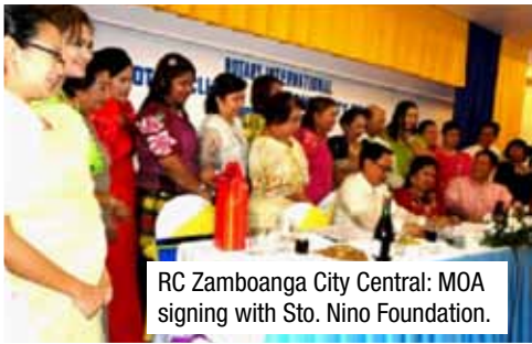
RC Zamboanga City Central: MOA signing with Sto. Nino Foundation.