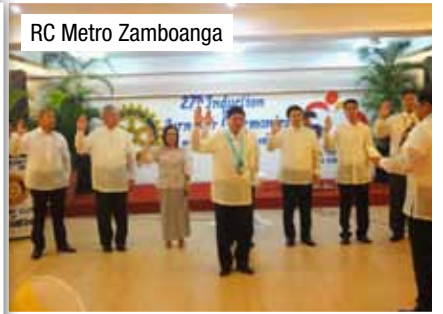
RC Metro Zamboanga