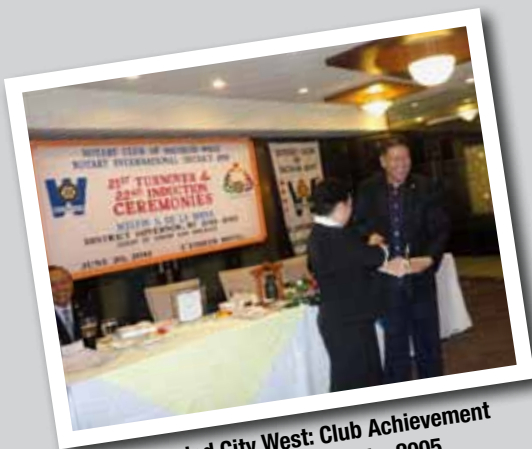
RC Bacolod City West: Club Achievement Award as exhibitor during the 2005 Centennial RI Convention