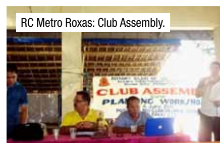
RC Metro Roxas: Club Assembly.