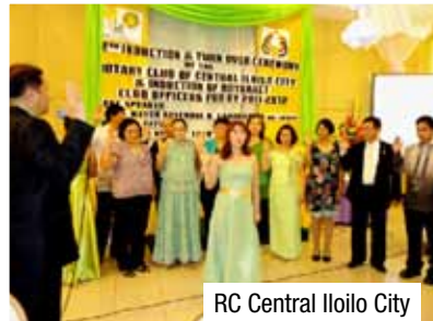
RC Central Iloilo City