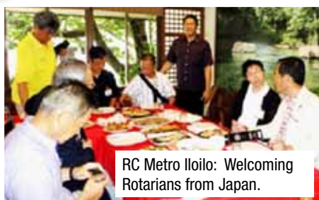
RC Metro Iloilo: Welcoming Rotarians from Japan.