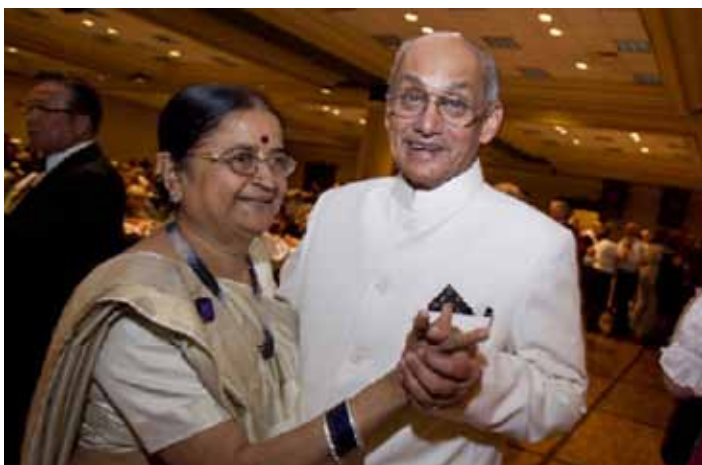
With spouse Binota during the International Assembly fellowship.

Our second emphasis will be continuity – finding the things we do well and taking them to the next level. We