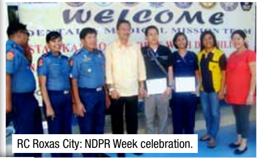
RC Roxas City: NDPR Week celebration.