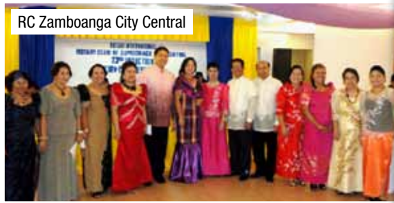
RC Zamboanga City Central