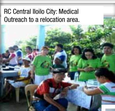
RC Central Iloilo City: Medical Outreach to a relocation area.