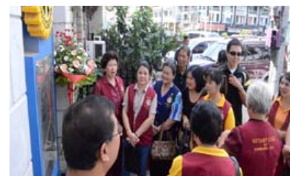
RC Zamboanga City: celebrating 64 years of Rotary in Zamboanga City.