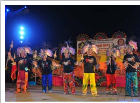
Udyakan Festival of RC Kabankalan