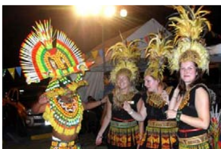
Enjoying the DISCON 2012 Opening Ceremony and GSE Presentation during the Governor's Ball