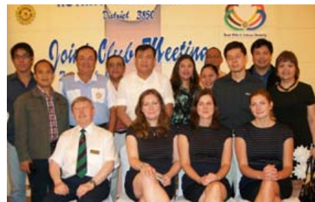
Joint club meeting with Rotary clubs of Bacolod City