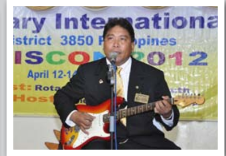
Original composition from Pres. Glenn de Guzman.