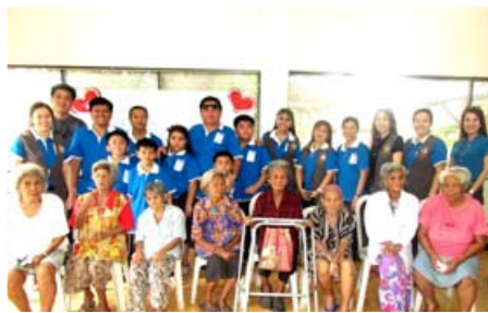
Rotary Anns of Zamboanga City West: Home for the Elderly annual visit.