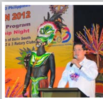
Iloilo City Mayor Jed Patrick Mabilog