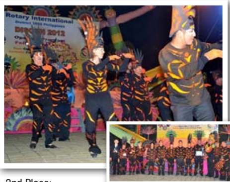
2nd Place: Rotary Club of Antique.