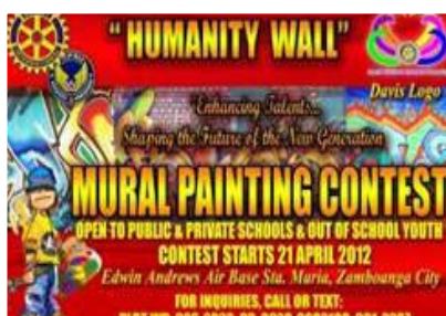
RC Zamboanga City Central: Mural Painting Contest.