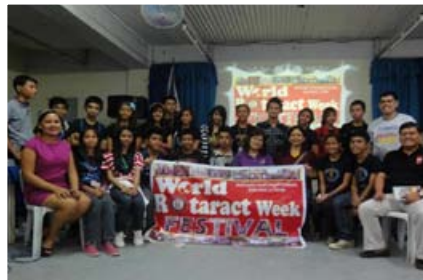
Rotaract & Interact Clubs of Zamboanga City: World Rotaract Week Festival.