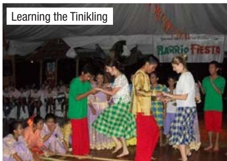
Learning the Tinikling