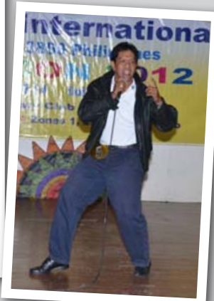
Some of Rotary's Got Talent contestants.