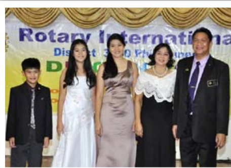
The District Governor and family presented.