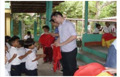
RC Metro Iloilo: Schoolbag distribution in Cubay Elementary School.