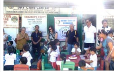
RC Dumangas: Children's Party in Poblacion Day Care Center.