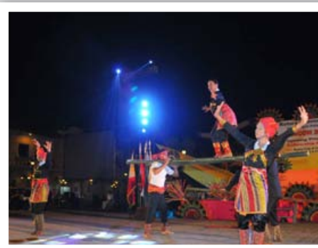
Lami-Lamikan Festival of RC Basilan