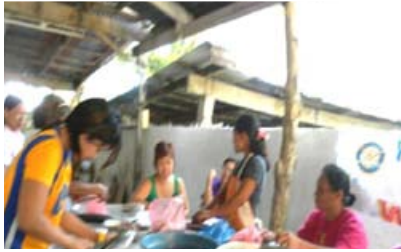
RC Metro Roxas Central: Seminar sponsorship on Bangus Deboning with Capiz State University.