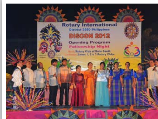
The University of San Agustin Alumni Association Choir