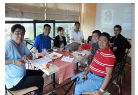
DISCON Committee Meeting, 11 March 2012.