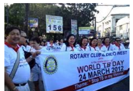
RC Iloilo West: World TB Day Fun Walk.