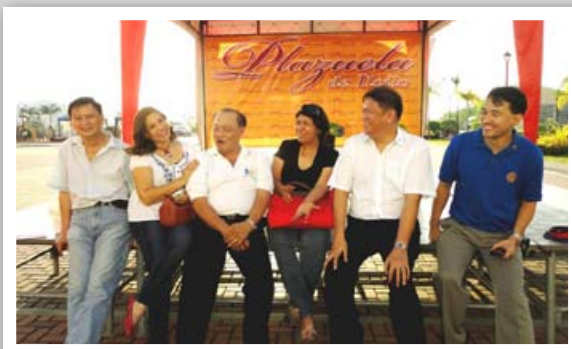
Rehearsal in Plazuela de Iloilo, venue for Opening Ceremony with Working Committees members.