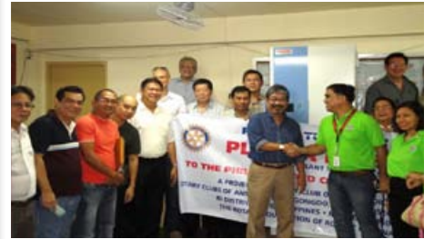
RC Metro Iloilo: Formal turn over of Plasma Freezer, a Matching Grant Project, to the Phil. Red Cross-Iloilo Chapter.