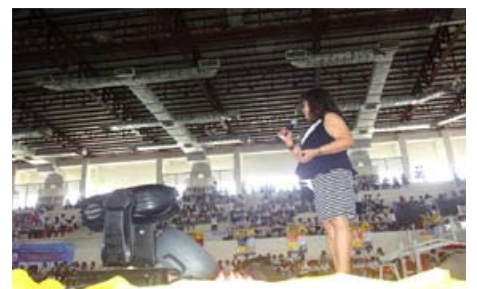
RC Zamboanga City Central: Sponsors Lead Forum with STI Rotaract Club.