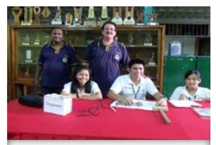
RC Metro Roxas: Election of officers, Capiz National High School Interact Club.