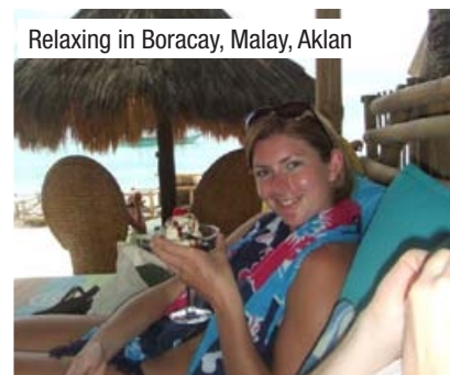
Relaxing in Boracay, Malay, Aklan