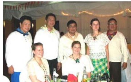
Fellowship Night in Zaycoland Resort, Kabankalan City