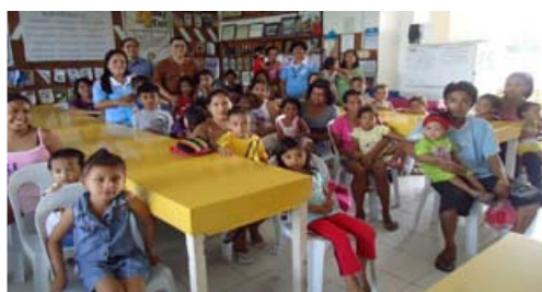
RC Kalibo: Feeding and Combat TB in Children in Brgy. Andagao