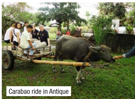
Carabao ride in Antique