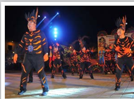
Patayaw Festival of RC Antique