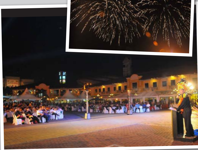
State of the District Address