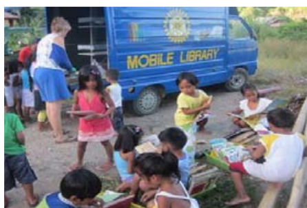
RC Boracay: Mobile Library.