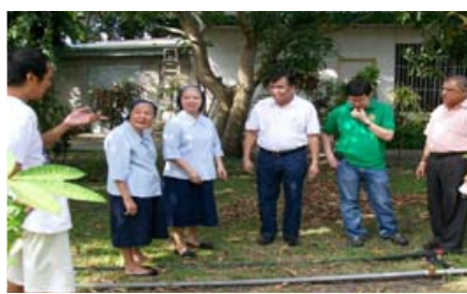
RC Bacolod North: Installation of water connection to the St. Vincent's Home for the Aged.