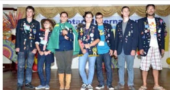
Inbound Rotary Youth Exchange.