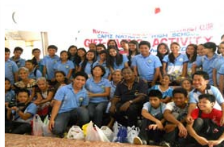
Capiz National High School Interact Club: Gift giving with RC Metro Roxas in the Home for the Aged.