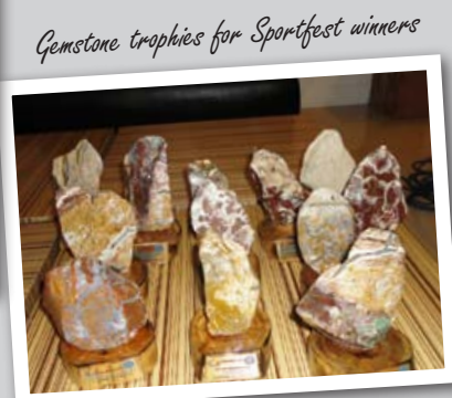
Gemstone trophies for Sportfest winners