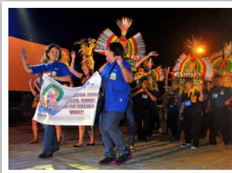
Ati-Atihan Festival with RC Kalibo