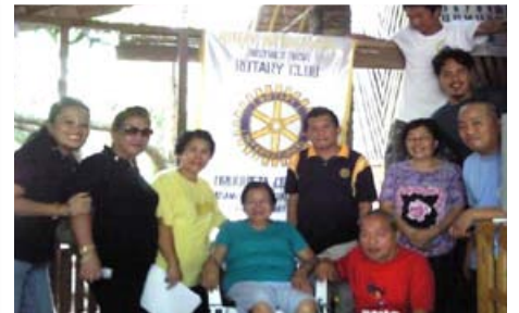
RC Oroquieta Centennial: Wheelchair donation.