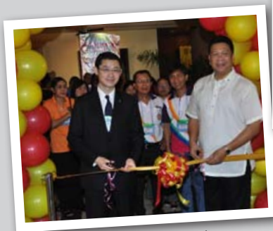
Opening of House of Friendship.