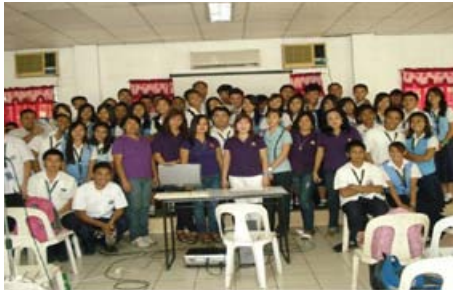
RC Central Iloilo City: Career Guidance in Angelicum School.