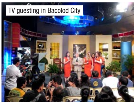
TV guesting in Bacolod City