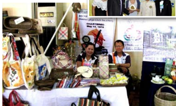
Rotary Club of Antique