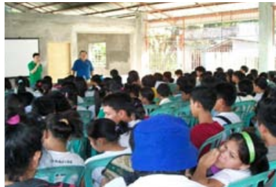
RC Bacolod North: Anti-TB and Anti-Smoking Campaign programs in Bacolod City HS.