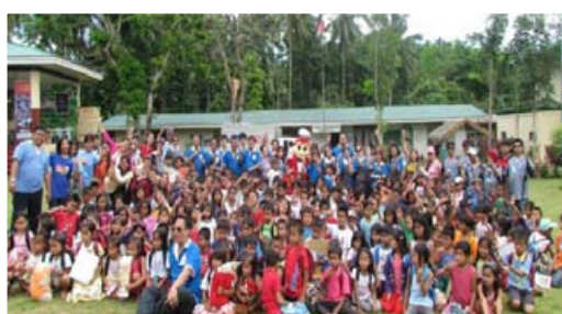
RC Zamboanga City West: Laruan Ko Para Sa'Yo, Pagkain Ko Hati Tayo 11th yr.