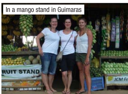
In a mango stand in Guimaras