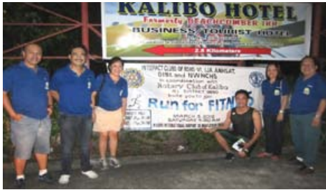
Interact Clubs (5) in Kalibo: Run for Fitness, with RC Kalibo.