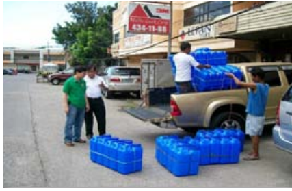
RC Bacolod North: Donation of water containers to earthquake victims.