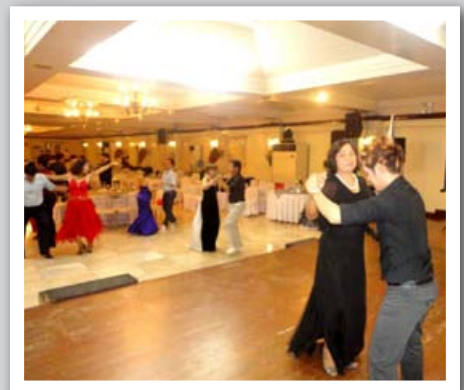
Fellowship that ensues.