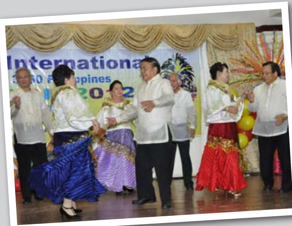
Folkdance from RC Iloilo.