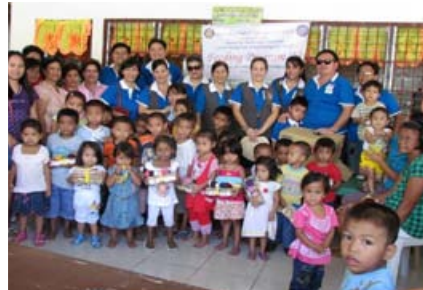
Rotary Anns of Zamboanga City West: Feeding and gift giving program.