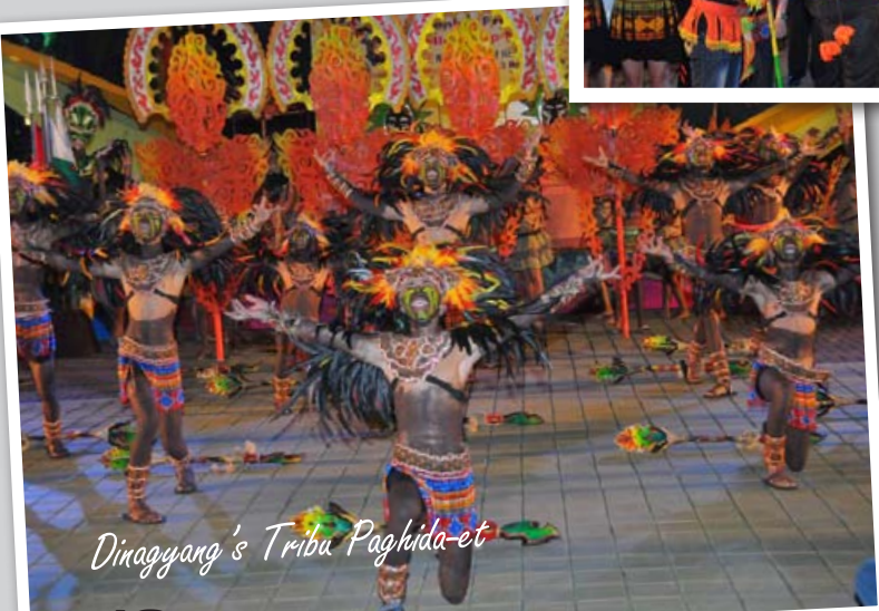
Dinagyang's Tribu Paghida-et