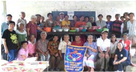
RC Basilan: Bingo Socials for senior citizens in Brgy. Colonia, Lamitan City.