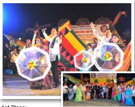
1st Place: Rotary Clubs in Zamboanga City.