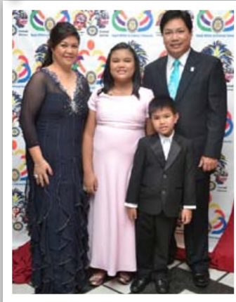
Pictorial with First Family, R4 2012-2013.