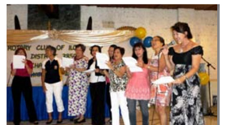
Rotary Spouses of RC Iloilo City: Song number during the 37th Charter Anniversary celebration.