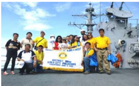
RC Iloilo West: Visit to the USS Chafee, a U.S. Navy guided missile destroyer.