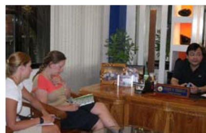
Courtesy call with Congressman Jerry Treñas of the Lone District of Iloilo City