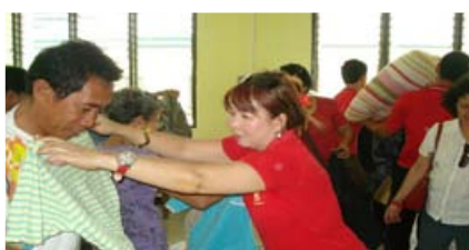
RC Central Iloilo City: Gift giving of assorted goods from LBC Foundation to the residents of Sta. Barbara Leprosarium.