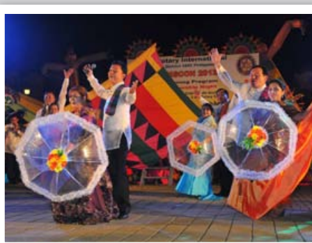
Zamboanga Hermosa of RCs from Zamboanga City