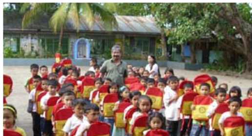
RC Metro Iloilo: Schoolbag distribution in Balabago Elementary School.