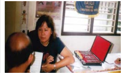
RC Basilan: Optical Mission with Eastside Senior Citizen and 104th Infantry Brigade at Isabela City.