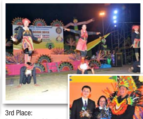
3rd Place: Rotary Club of Basilan.