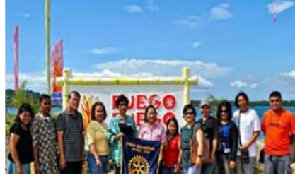
RC Basilan: 52nd Charter Anniversary celebration with a Family Day fellowship activity.