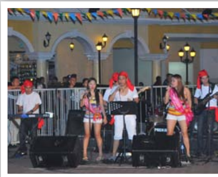
Midnight Shift Band