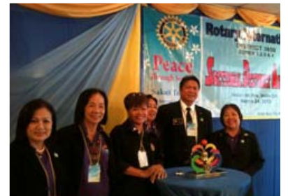
RC Metro Roxas Central; With Gov. Melvin during the DISTAS for Zones 1 to 4.