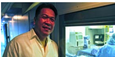
DG Melvin de la Serna observing an eye surgery in Orbis Flying Eye Hospital, Iloilo International Airport, Feb 20-March 2, 2012.