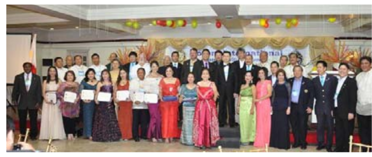
Presentation and awarding of The Rotary Foundation contributors.