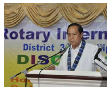
Governor Art Defensor of Iloilo.