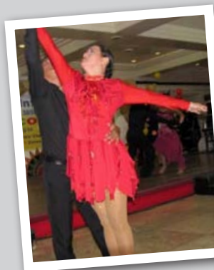
The contenders of Ballroom Dancing competition show their terpsichorean prowess.