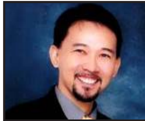
PP TRES ARANDELA III District Conference 2012 Chair Rotary Club of Iloilo South