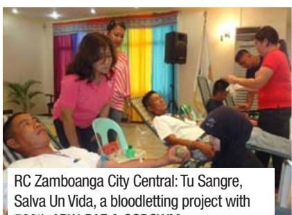
RC Zamboanga City Central: Tu Sangre, Salva Un Vida, a bloodletting project with 530th ABW, PAF & CGDSWM.