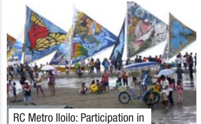
RC Metro Iloilo: Participation in Paraw Regatta as judges.