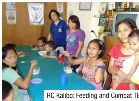
RC Kalibo: Feeding and Combat TB in Children in Brgy. Andagao, Kalibo, Aklan.