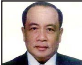
PP EMS ENCANTO Booths Rotary Club of Jaro Iloilo City