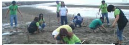
RC Central Iloilo City: Mangrove planting with Rotaractors, a Greeneration project in Banate, Iloilo.