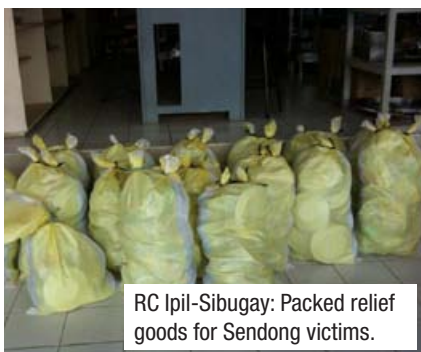
RC Ipil-Sibugay: Packed relief goods for Sendong victims.