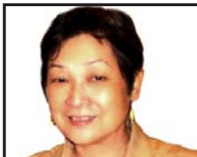
PDG EMS NAVA Registration/Banquets Rotary Club of Central Iloilo City