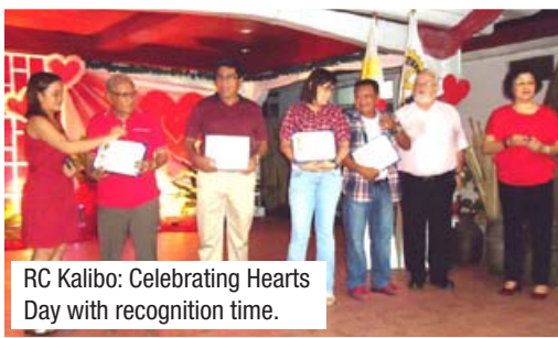
RC Kalibo: Celebrating Hearts Day with recognition time.