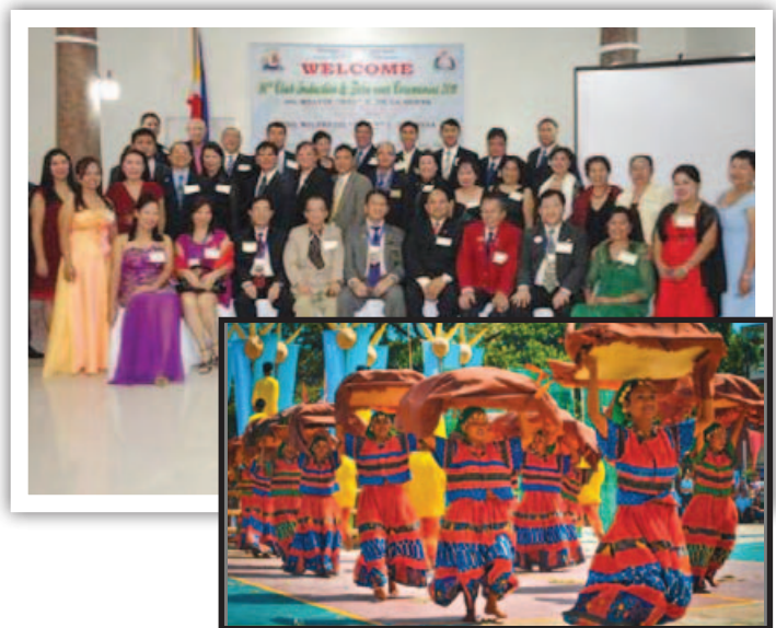
RC Antique: Patayaw Festival