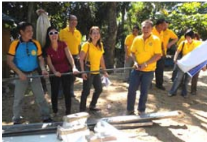
RC Bacolod South: Project CR with Tuloy Pinoy.