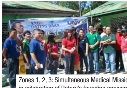
Zones 1, 2, 3: Simultaneous Medical Mission in 10 Rotary Districts of the Phils with UNTV, and in celebration of Rotary's founding anniversary. Project done in Tabuc Suba, Jaro, Iloilo City.