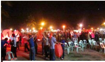
Zones 11 and 12: World Peace and Understanding Day celebration, 107th Founding Anniversary of Rotary.