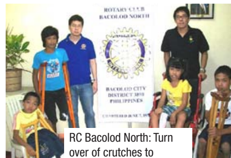
RC Bacolod North: Turn over of crutches to children with disabilities.