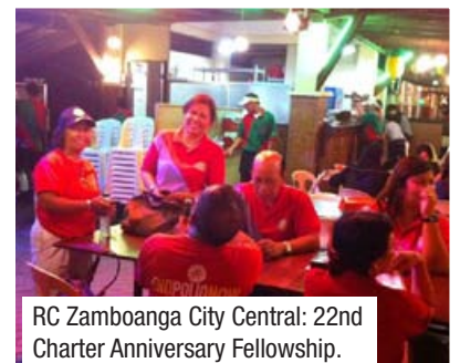
RC Zamboanga City Central: 22nd Charter Anniversary Fellowship.