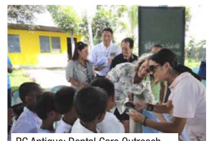
RC Antique: Dental Care Outreach to pupils of Catunggan Elementary School with Mending Faces Mission.