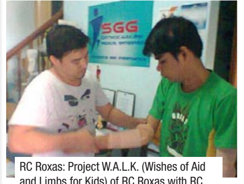
RC Roxas: Project W.A.L.K. (Wishes of Aid and Limbs for Kids) of RC Roxas with RC Forbes Park partnership.