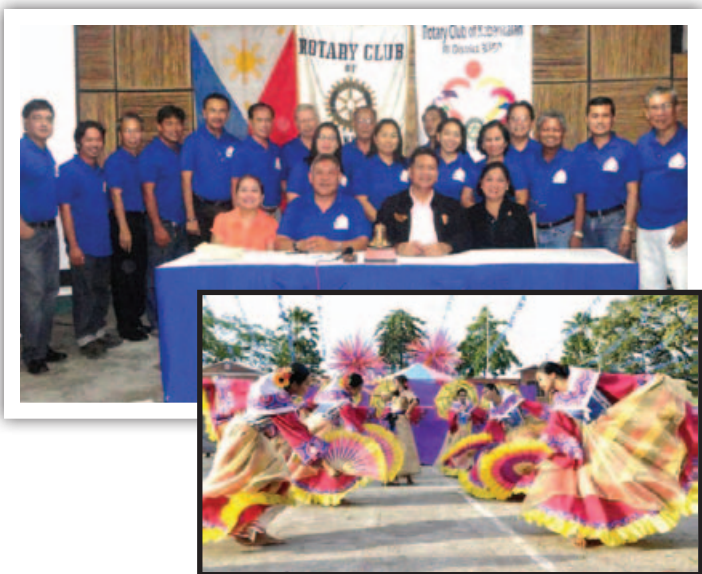
RC Kabankalan: Udyakan Festival