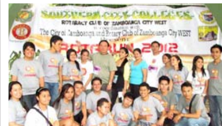
Rotaract Club of Zamboanga City West: RotaRun 2012, a fund raising with RC ZC West, Southern City Colleges and Zamboanga City LGU.