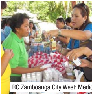
RC Zamboanga City West: Medical and Dental Mission with Zamboanga Hermosa Canada.