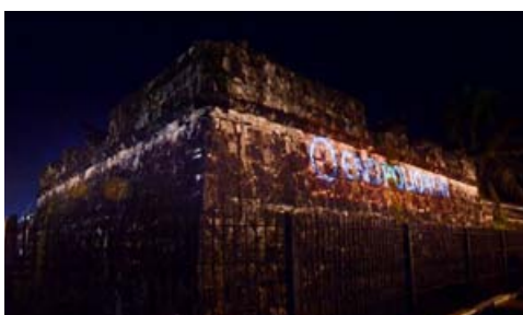
Zones 10 and 11: Lighting of End Polio Now in prominent edifices-Fort Pilar and Zamboanga City Hall.