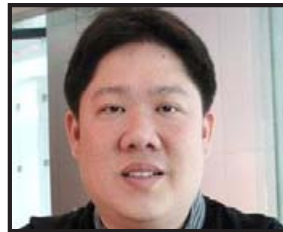
PP KANO NG DISCON 2012 Co-Chair/Evaluation Rotary Club of Metro Iloilo