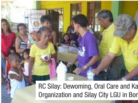
RC Silay: Deworming, Oral Care and Katcha Project with the Spouses Organization and Silay City LGU in Bongol Elementary School, Silay City.