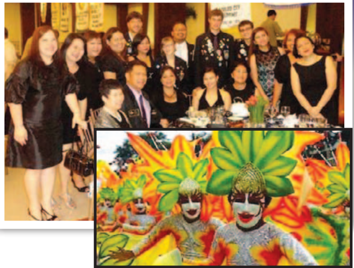
RC Bacolod Central: MassKara Festival

Which Club will be DISCON 2012 Champion in the Festival Competition? Watch for them during the Opening Ceremony at Plazuela de Iloilo, Mandurriao, Iloilo City on 12 April 2012.