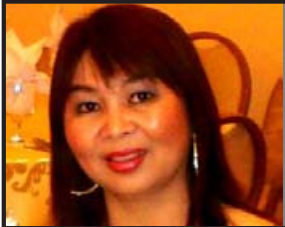
PRES. BOPEEP ONG Competitions/Judges Rotary Club of Central Iloilo City