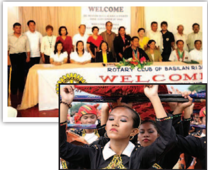
RC Basilan: Lami-Lamihan Festival