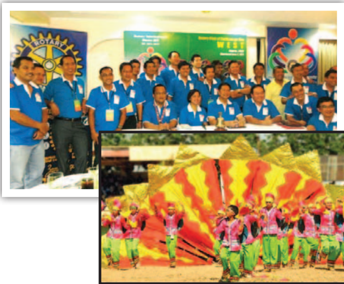
RC ZC West: Zamboanga Hermosa Festival