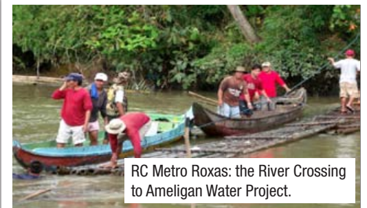
RC Metro Roxas: the River Crossing to Ameligan Water Project.