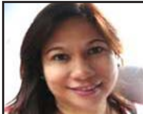
AG DIAL JARDELEZA Banquets Rotary Club of Iloilo South