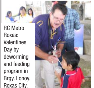
RC Metro Roxas: Valentines Day by deworming and feeding program in Brgy. Lonoy, Roxas City.