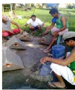
RC Metro Roxas: Production of the river crossing anchors for the Ameligan Matching Grant.