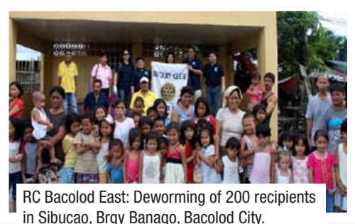
RC Bacolod East: Deworming of 200 recipients in Sibucan, Brgy Banago, Bacolod City.