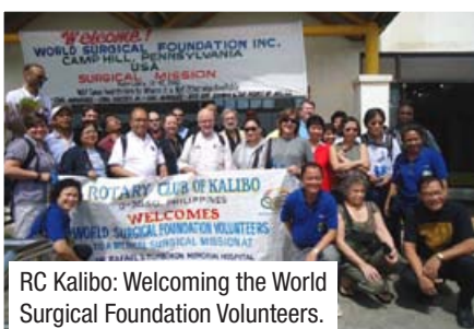
RC Kalibo: Welcoming the World Surgical Foundation Volunteers.