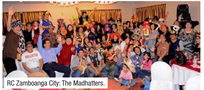
RC Zamboanga City: The Madhatters.