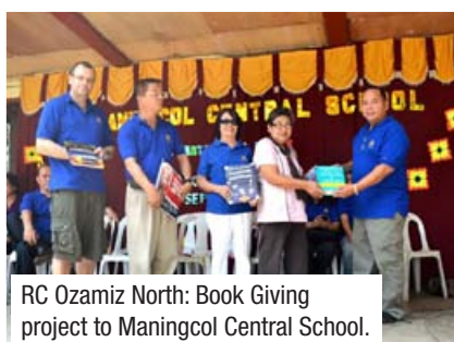
RC Ozamiz North: Book Giving project to Maningcol Central School.