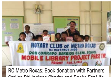
RC Metro Roxas: Book donation with Partners Smiles Philippines Charity and Books For Life.