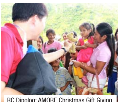
RC Dipolog: AMORE Christmas Gift Giving.