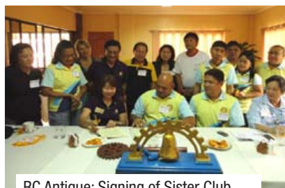
RC Antique: Signing of Sister Club Agreement with RC Central Iloilo City.