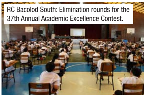
RC Bacolod South: Elimination rounds for the 37th Annual Academic Excellence Contest.