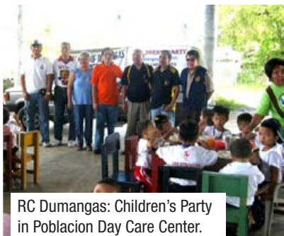
RC Dumangas: Children's Party in Poblacion Day Care Center.