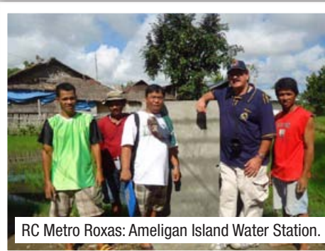
RC Metro Roxas: Ameligan Island Water Station.