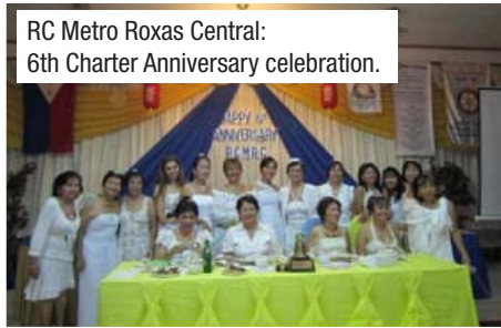
RC Metro Roxas Central: 6th Charter Anniversary celebration.