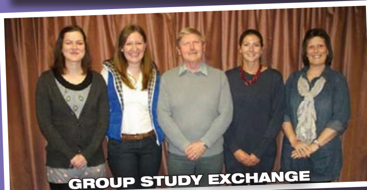
GROUP STUDY EXCHANGE