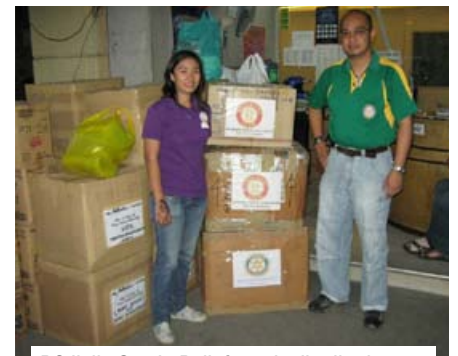
RC Iloilo South: Relief goods distribution to fire victims of 4 barangays in Iloilo City.