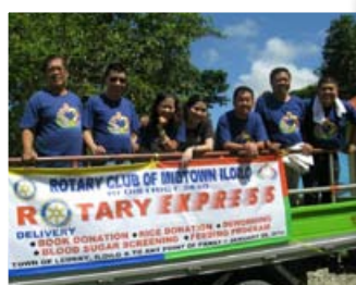
RC Midtown Iloilo: Rotary Express Delivery project in Lemery, Iloilo.