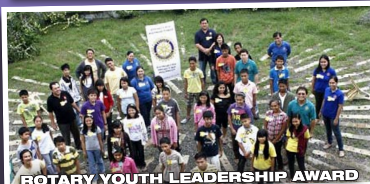
ROTARY YOUTH LEADERSHIP AWARD