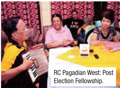
RC Pagadian West: Post Election Fellowship.