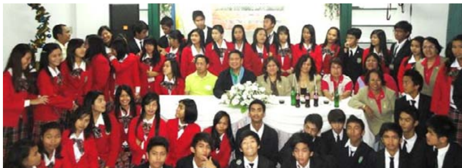
Interact Club of Ferndale, sponsored by RC Zamboanga City Central