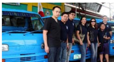
RC Bacolod East: Donation of 3 multi-purpose vehicles to Brgy. Manadalagan, Bacolod City.