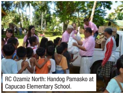
RC Ozamiz North: Handog Pamasko at Capucao Elementary School.