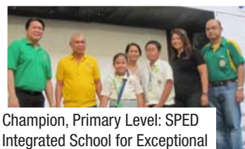
Champion, Primary Level: SPED Integrated School for Exceptional Children, Iloilo City.