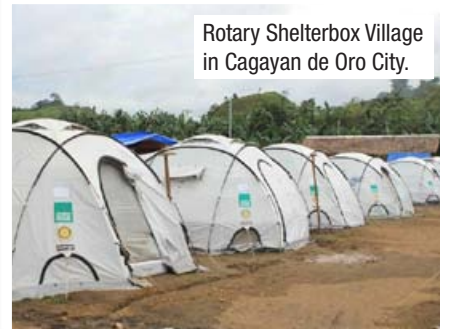
Rotary Shelterbox Village in Cagayan de Oro City.