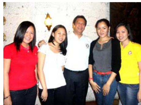
Rotaract Club sponsored by RC Iloilo City