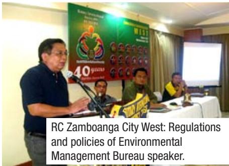
RC Zamboanga City West: Regulations and policies of Environmental Management Bureau speaker.