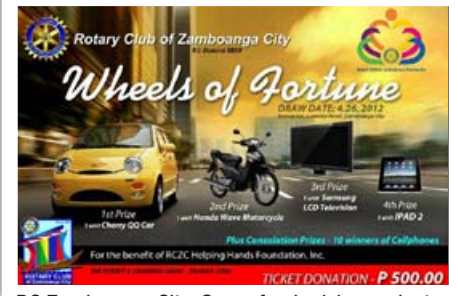
RC Zamboanga City: Super fund raising project.