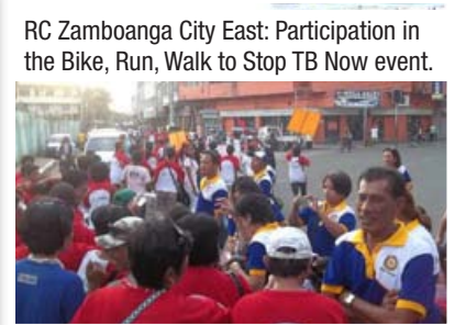
RC Zamboanga City East: Participation in the Bike, Run, Walk to Stop TB Now event.