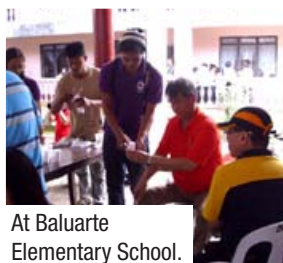
At Baluarte Elementary School.