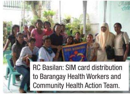
RC Basilan: SIM card distribution to Barangay Health Workers and Community Health Action Team.