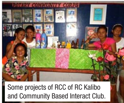
Some projects of RCC of RC Kalibo and Community Based Interact Club.