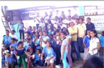
At I. Arroyo Elementary School.