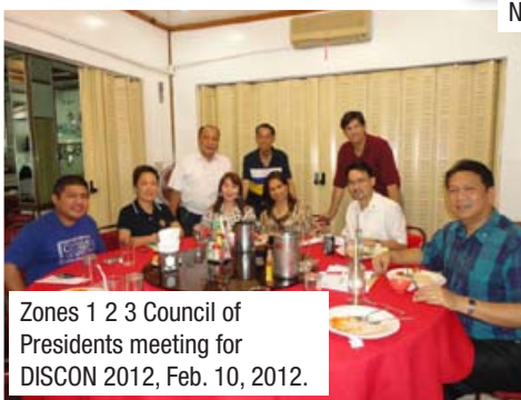
Zones 1 2 3 Council of Presidents meeting for DISCON 2012, Feb. 10, 2012.