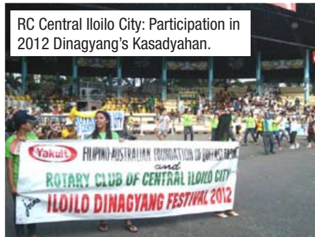
RC Central Iloilo City: Participation in 2012 Dinagyang's Kasadyahan.