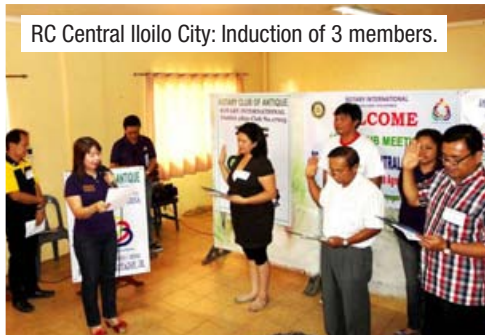
RC Central Iloilo City: Induction of 3 members.