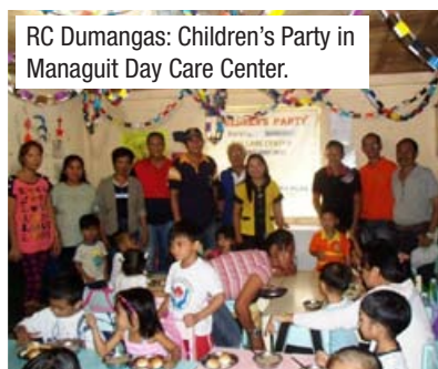
RC Dumangas: Children's Party in Managuit Day Care Center.