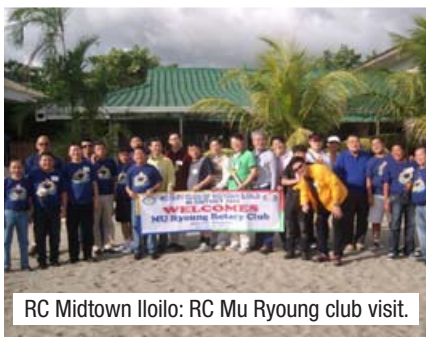
RC Midtown Iloilo: RC Mu Ryoung club visit.