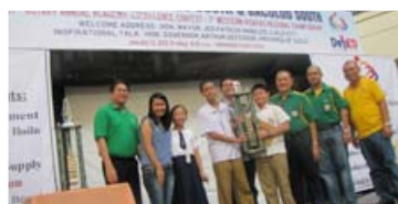
Champion, Intermediate Level: Iloilo Westbridge School.