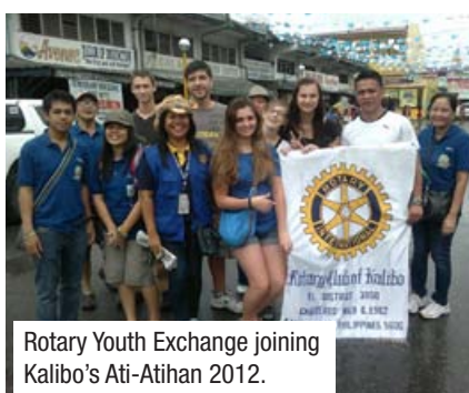
Rotary Youth Exchange joining Kalibo's Ati-Atihan 2012.