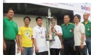
Champion, Secondary Level: St. La Salle University, Bacolod City.