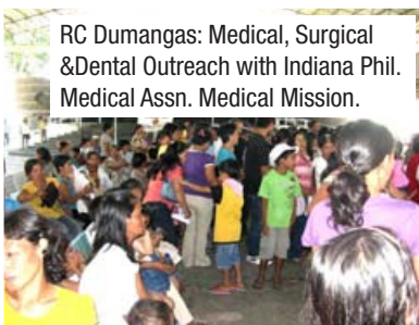
RC Dumangas: Medical, Surgical & Dental Outreach with Indiana Phil. Medical Assn. Medical Mission.