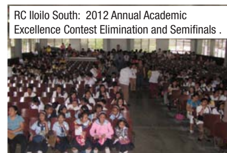
RC Iloilo South: 2012 Annual Academic Excellence Contest Elimination and Semifinals.