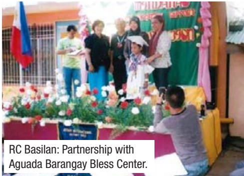
RC Basilan: Partnership with Aguada Barangay Bless Center.