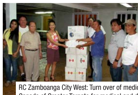
RC Zamboanga City West: Turn over of medicine, sorting, with Zamboanga Hermosa Canada of Greater Toronto for medical and dental mission, and feeding program.