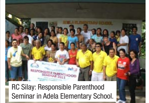
RC Silay: Responsible Parenthood Seminar in Adela Elementary School.