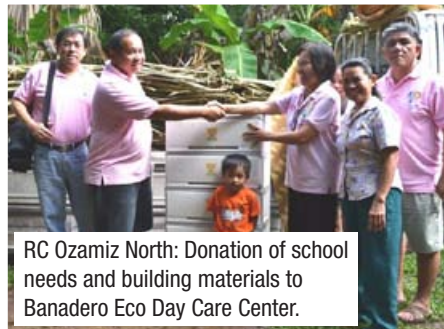
RC Ozamiz North: Donation of school needs and building materials to Banadero Eco Day Care Center.