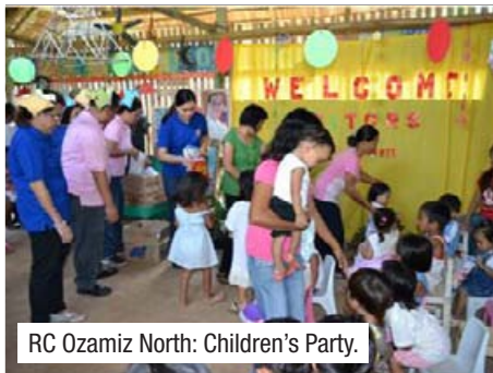
RC Ozamiz North: Children's Party.