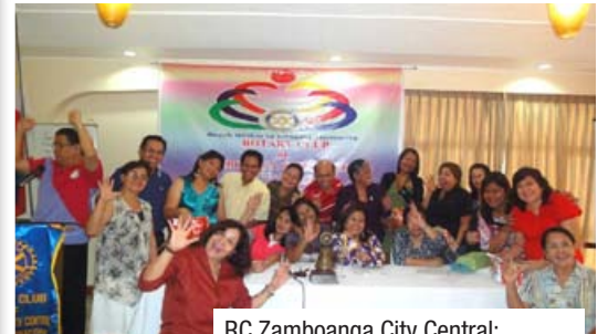
RC Zamboanga City Central: Post Election Christmas Fellowship.