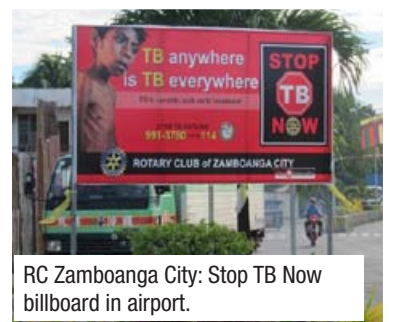
RC Zamboanga City: Stop TB Now billboard in airport.