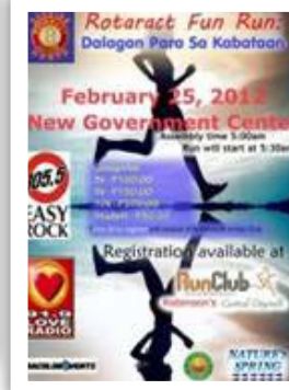
Rotaract Club of Bacolod North: Fun Run: Dalagan Para Sa Kabataan.