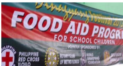
RC Metro Iloilo: Dinagyang Festival 2012 Food Aid Program for School Children, Iloilo City.