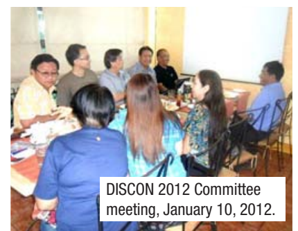
DISCON 2012 Committee meeting, January 10, 2012.