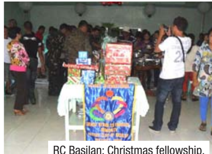
RC Basilan: Christmas fellowship.