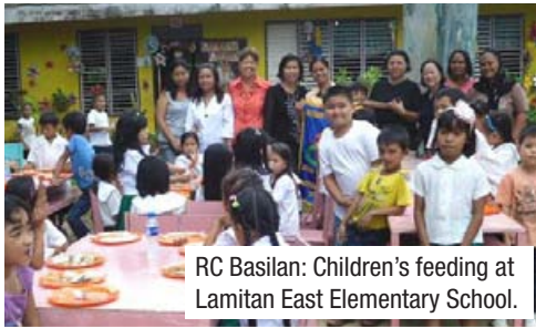
RC Basilan: Children's feeding at Lamitan East Elementary School.