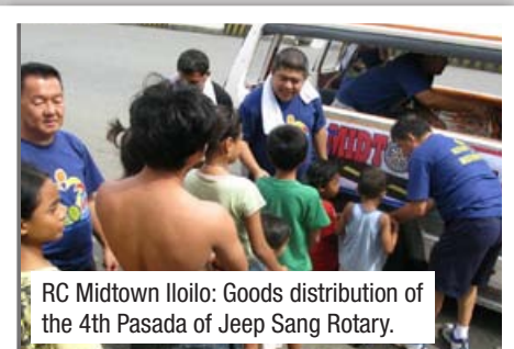
RC Midtown Iloilo: Goods distribution of the 4th Pasada of Jeep Sang Rotary.