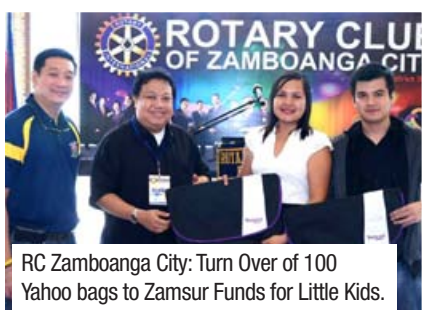
RC Zamboanga City: Turn Over of 100 Yahoo bags to Zamsur Funds for Little Kids.