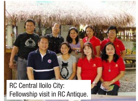
RC Central Iloilo City: Fellowship visit in RC Antique.