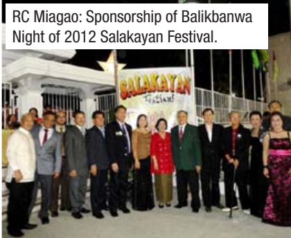
RC Miagao: Sponsorship of Balikbanwa Night of 2012 Salakayan Festival.