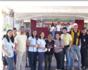
At Lapuz Elementary School.