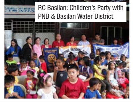
RC Basilan: Children's Party with PNB & Basilan Water District.