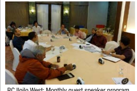
RC Iloilo West: Monthly guest speaker program.