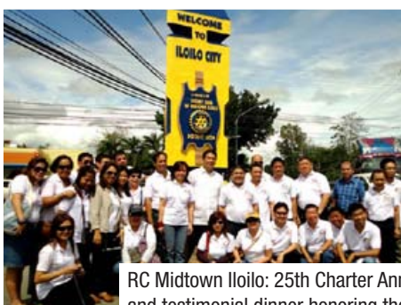
RC Midtown Iloilo: 25th Charter Anniversary celebration—unveiling of the new marker and testimonial dinner honoring the past presidents, with sister club RC Marikina East.