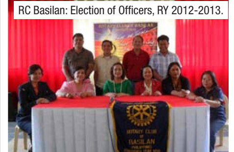
RC Basilan: Election of Officers, RY 2012-2013.