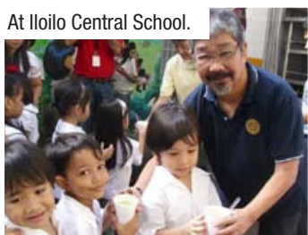
At Iloilo Central School.