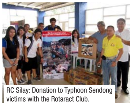
RC Silay: Donation to Typhoon Sendong victims with the Rotaract Club.