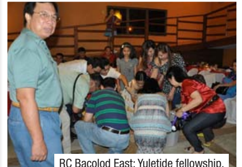
RC Bacolod East: Yuletide fellowship.