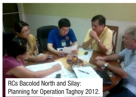
RCs Bacolod North and Silay: Planning for Operation Taghoy 2012.