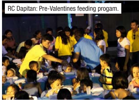
RC Dapitan: Pre-Valentines feeding program.