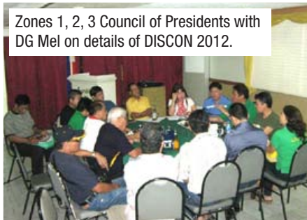
Zones 1, 2, 3 Council of Presidents with DG Mel on details of DISCON 2012.