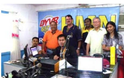
RC Metro Roxas: DYVR Radio guesting in partnership with deworming and feeding projects.