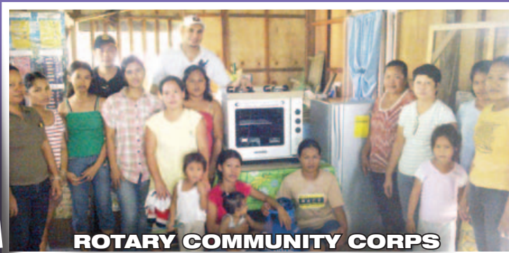
ROTARY COMMUNITY CORPS