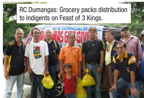
RC Dumangas: Grocery packs distribution to indigents on Feast of 3 Kings.