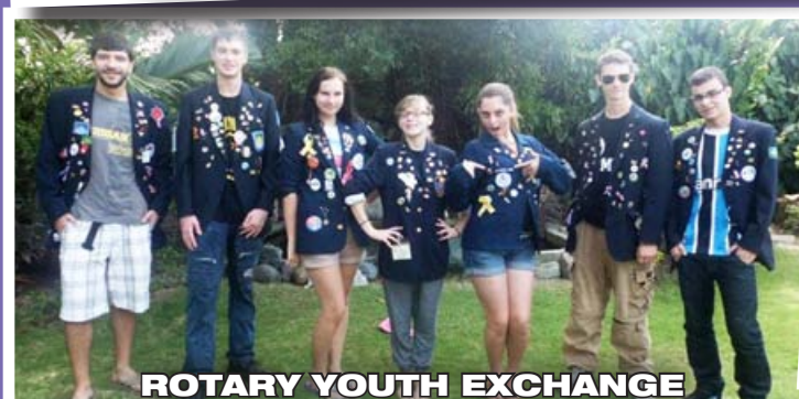
ROTARY YOUTH EXCHANGE