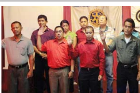
RC Pagadian: Four of the eight members inducted.