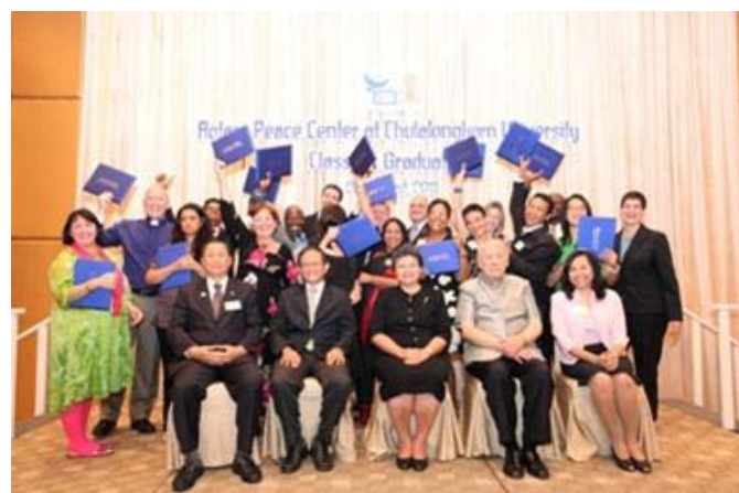
The 2011 Summer Rotary Peace Fellows graduated from the Professional Development Certificate program in June. The Winter 2012 class will start in February.