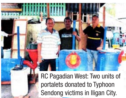
RC Pagadian West: Two units of portalets donated to Typhoon Sendong victims in Iligan City.